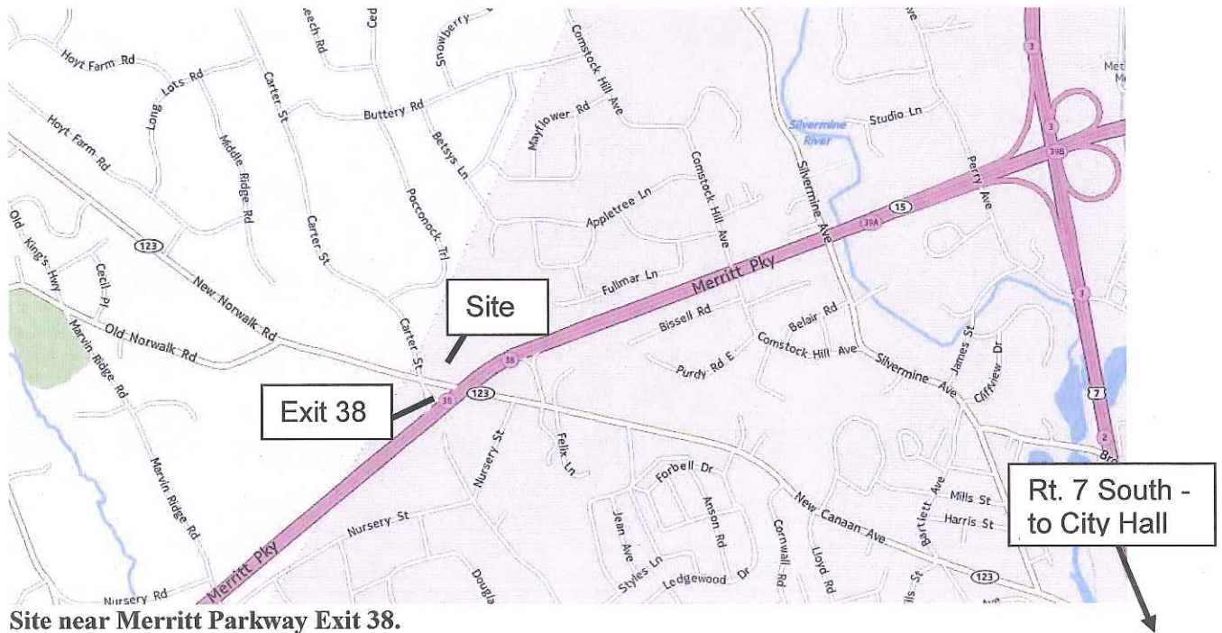
Site near Merritt Parkway Exit 38.