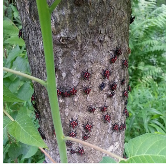
Figure 2. Late stage SLF nymphs.

Traps are used to intercept SLF nymphs and adults as they crawl up the tree trunk. We suggest setting traps as soon as SLF hatch (late April through June). Traps can capture large numbers of nymphs. While adult SLF can also be captured by tree traps, they may avoid them, resulting in less effectiveness later in the season. Two types of traps are often used to capture SLF: sticky bands and a funnel-style trap called a "circle trap."