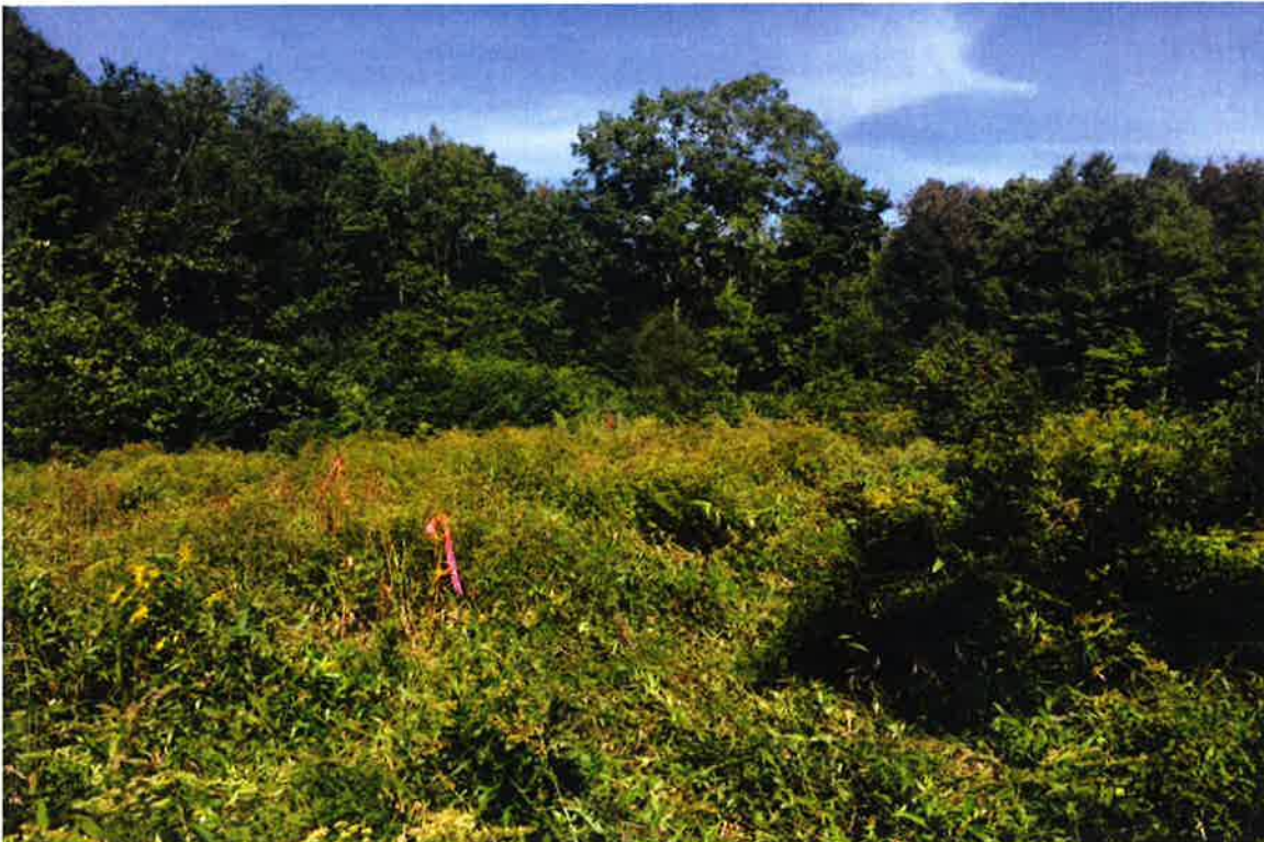
Photo 2: View of staging area and wetland clearing limit line looking north.