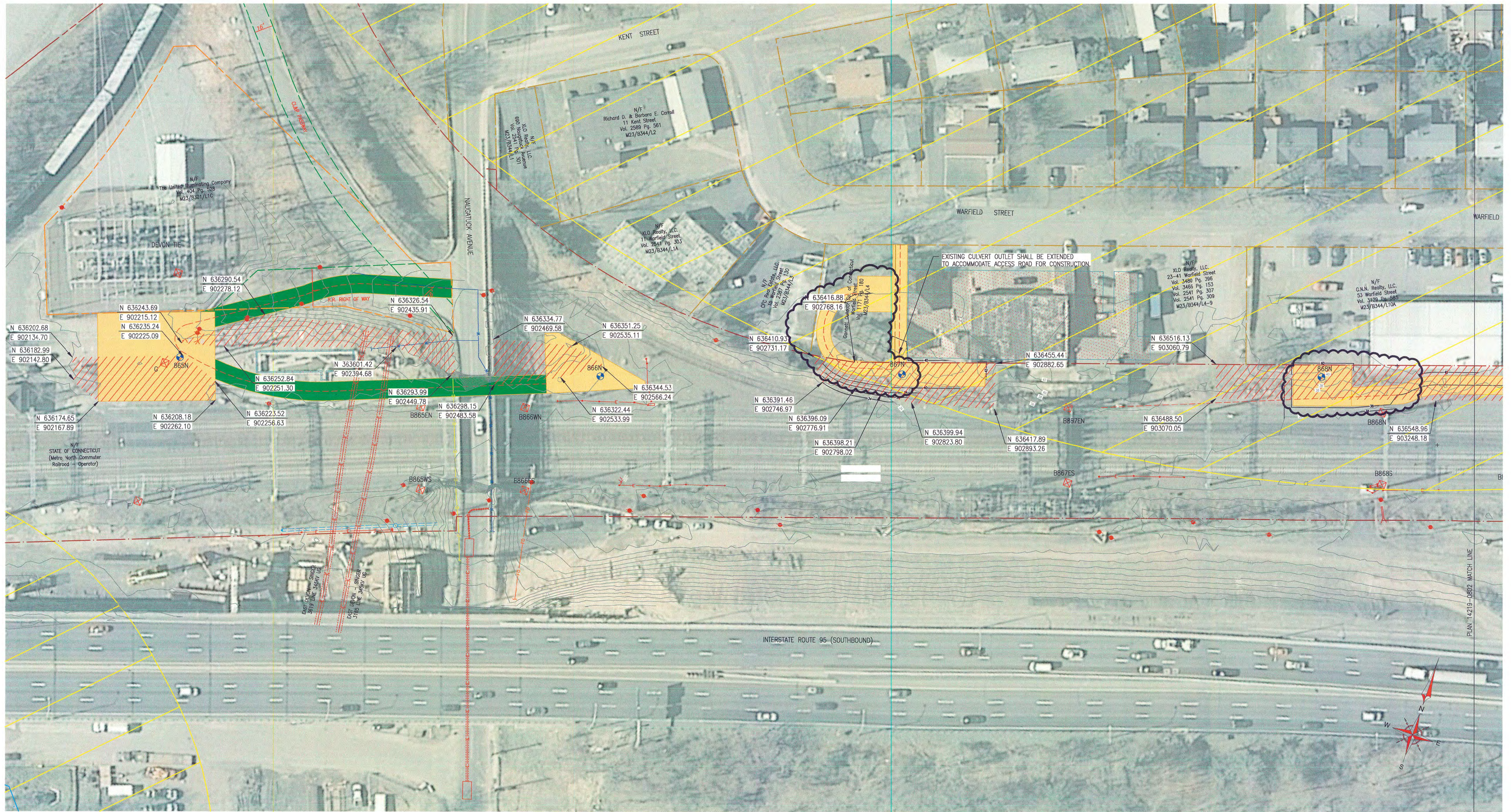
CONTEXT MAP INDEX MAP