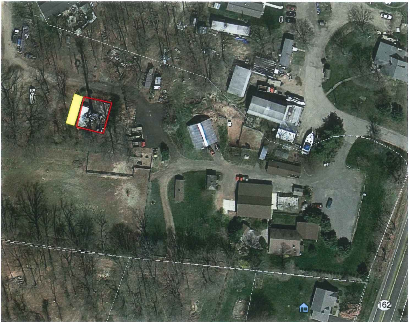
Google Earth Image of site location at 668 Jones Hill Road, West Haven. Yellow box is approximate expansion area. Red outline is existing compound.