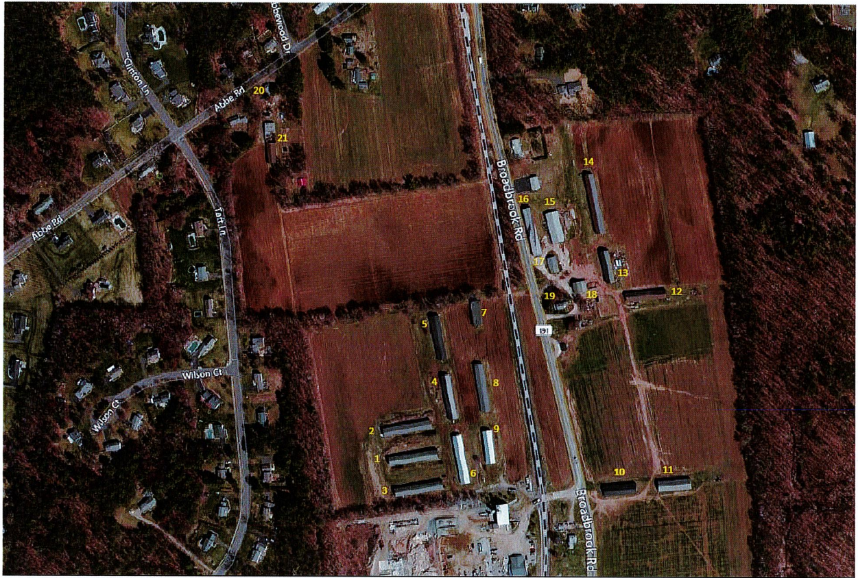
(Nutmeg 1, Tab S – Phase 1A Report, pp. 32-33)