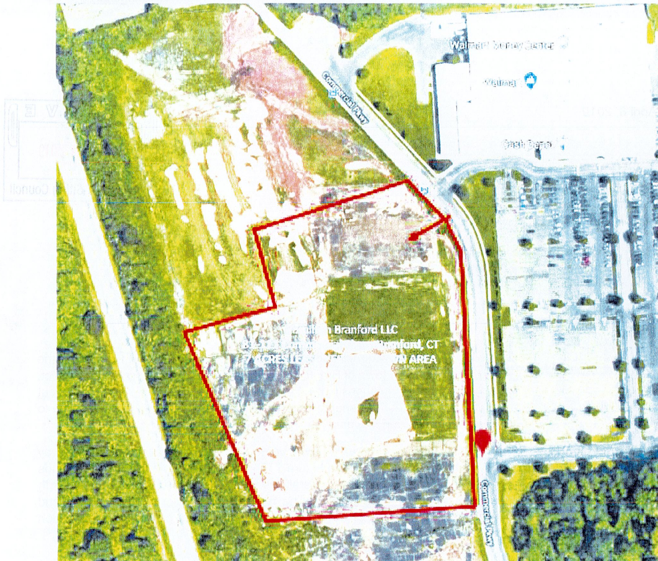
Figure 1: Staging Area/Laydown Yard, 81 Commercial Parkway