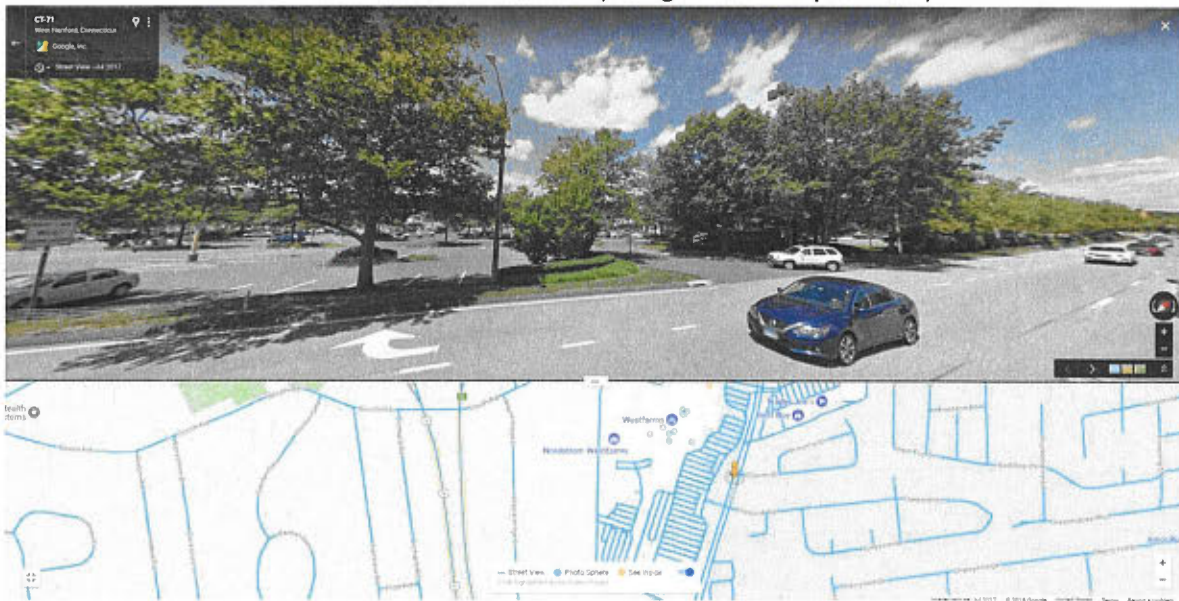
Viewpoint #3 (for purposes of Exhibit F)

East of the Site from Route 71 (facing solar rooftop location):