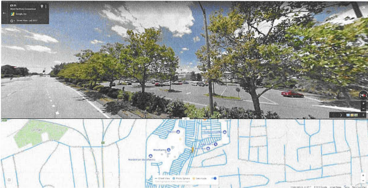
Viewpoint #2 (for purposes of Exhibit F)

East of the Site from Route 71 (facing solar rooftop location):