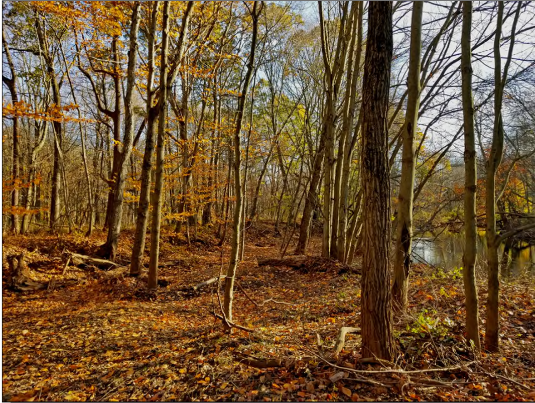
Photo 9A: Wetland A2 (MIRA Property); note higher moderately well drained floodplain terrace to the left; facing southerly