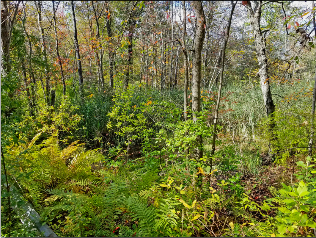
Photo 9B: Wetland B3; southeastern corner; note Phragmites in background; facing northwesterly