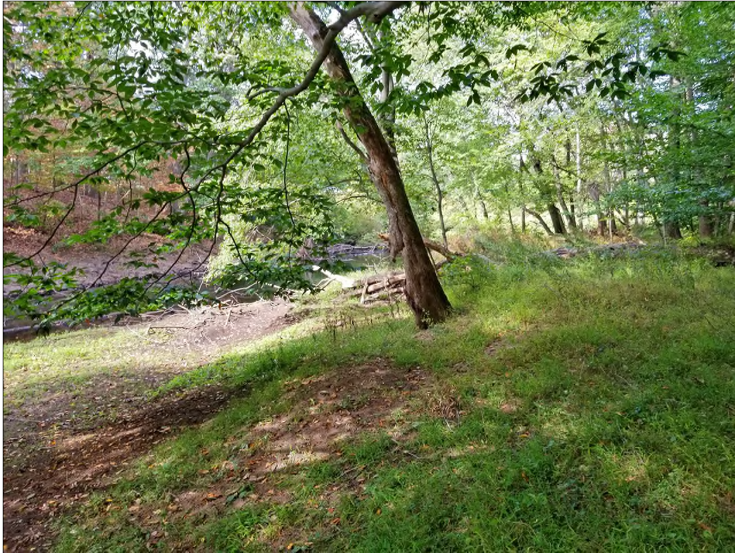
Photo 7A: Wetland A2; MIRA Property; note floodplain terraces dominated by annuals in the herb layer, poorly to very poorly drained; facing northwesterly