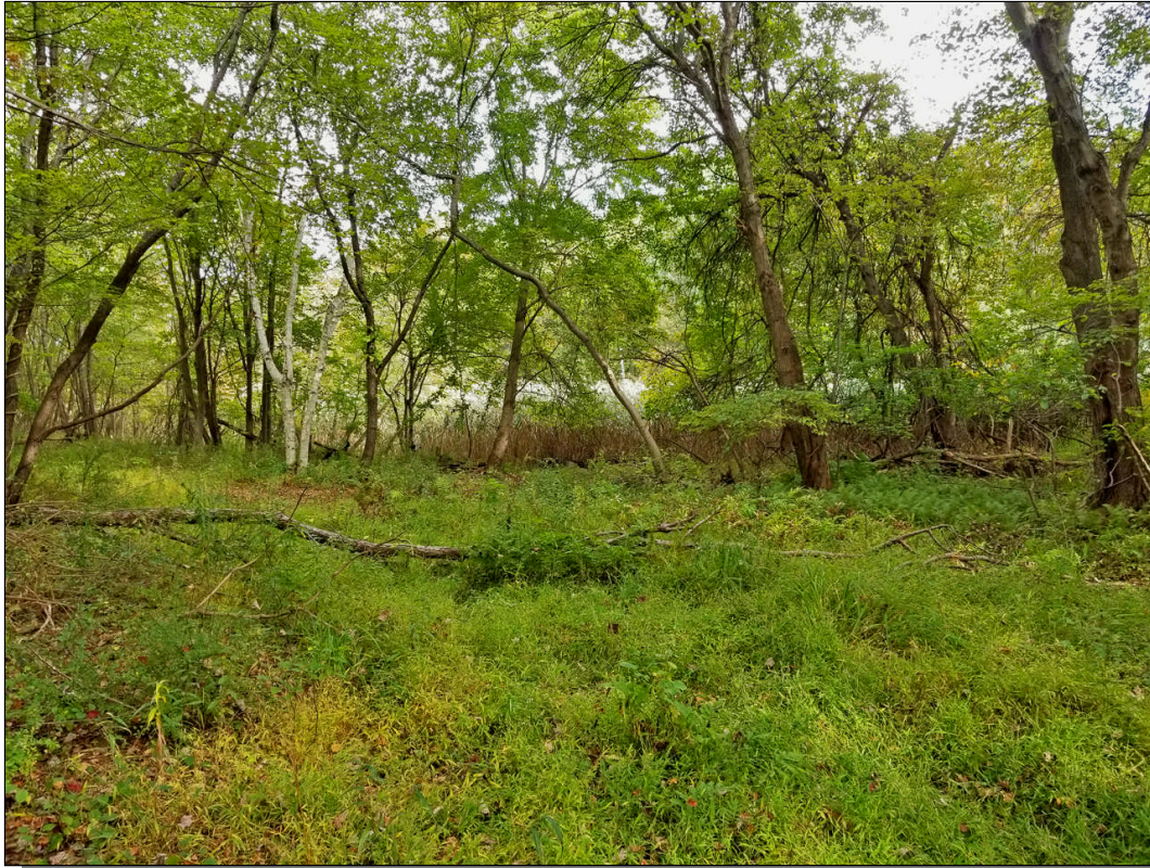
Photo 7B: Wetland B2; western section; note Phragmites in background; facing southeasterly