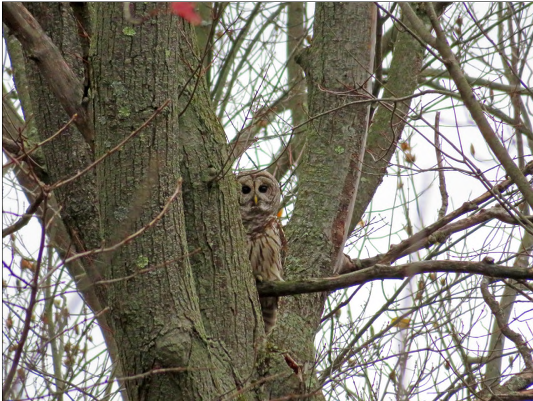
Photo 12B: Wetland B3, barred owl at the southwestern forested section