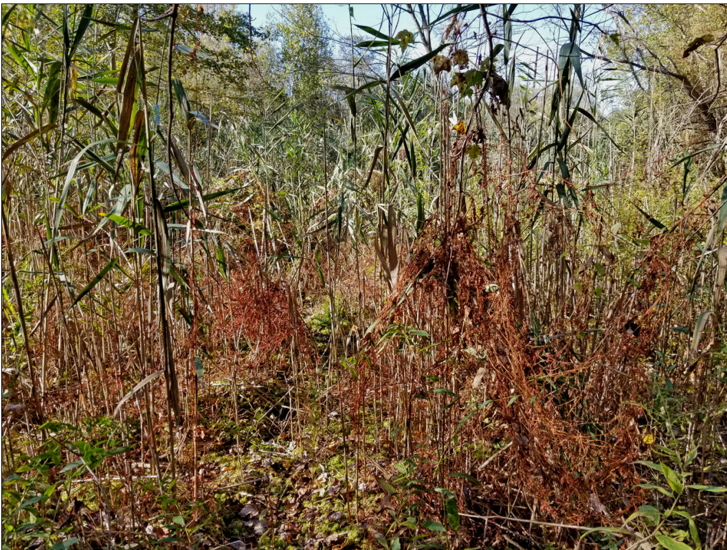
Photo 14B: Wetland B3, Phragmites and mile-a-minute vine; eastern section; facing northerly