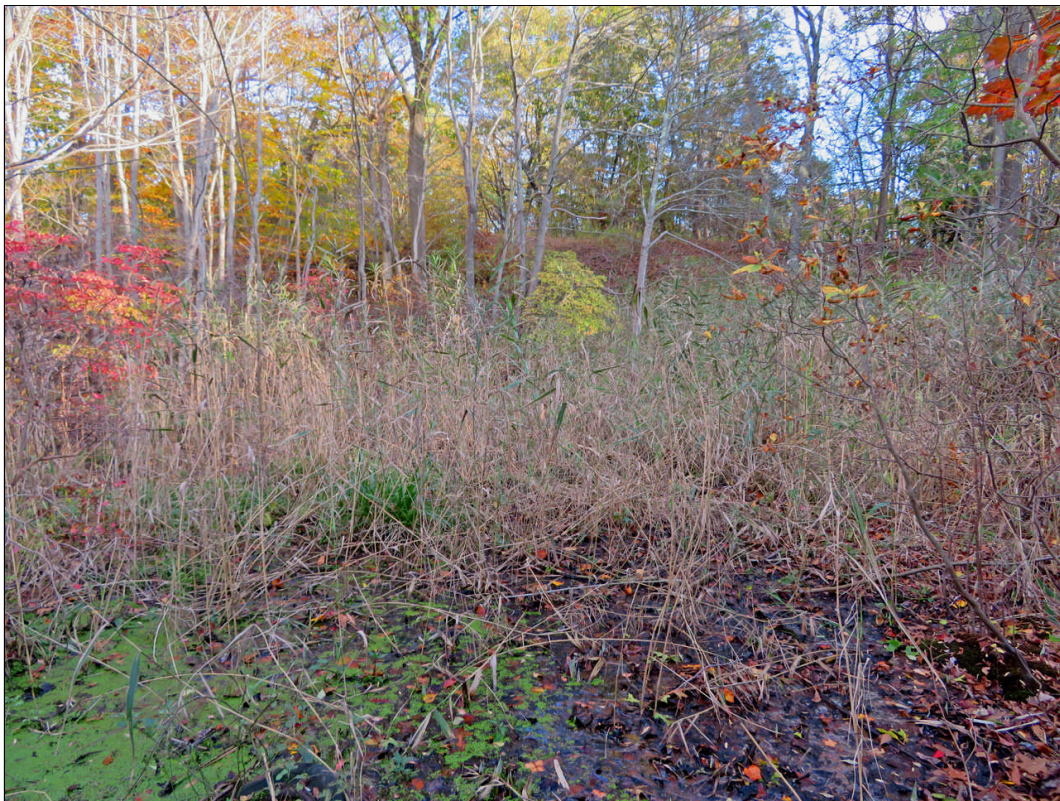
Photo 18B: Wetland B4; southeastern corner; note steep hillside in background; facing southeasterly