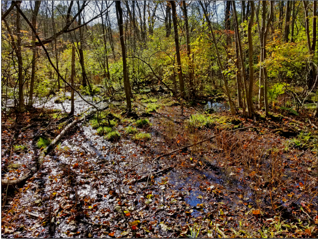
Photo 19B: Wetland B4; northeasterly forested section; hillside seepage; facing southwesterly