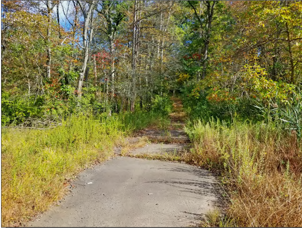
Photo 11B: Old abandoned access roadway between Wetlands B3 and B4; facing easterly