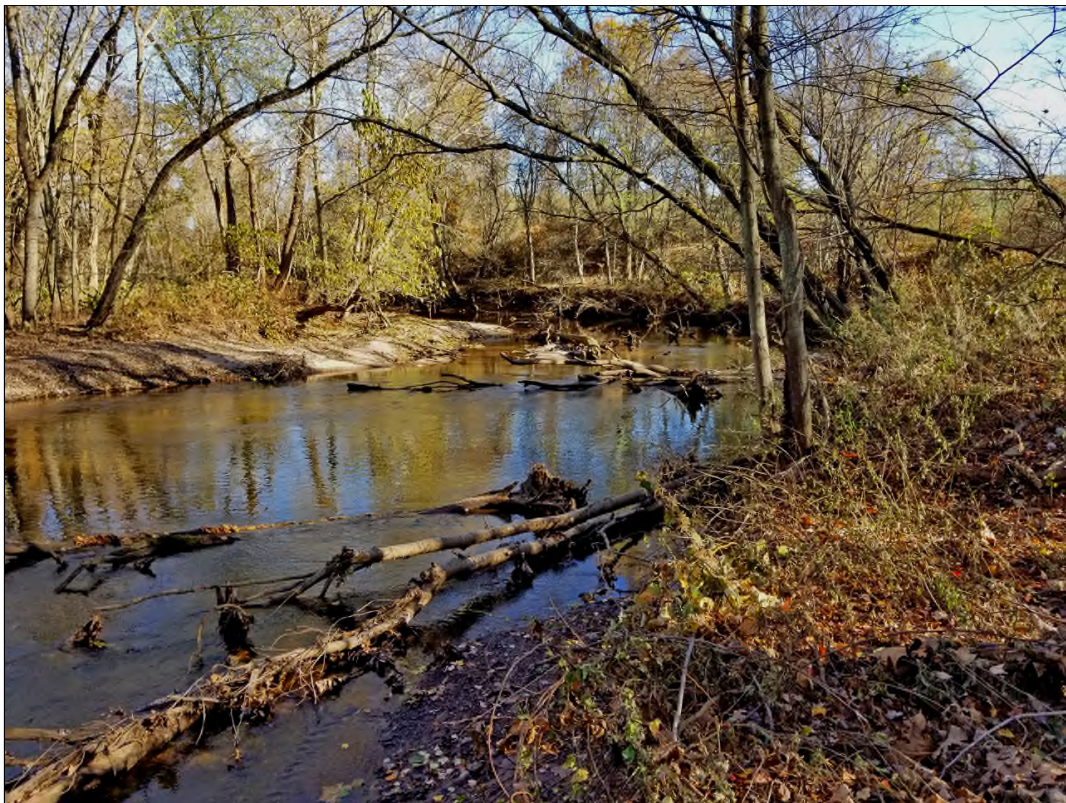
Photo 10A: Wetland A2; Town Property; note landfill in the background; facing easterly