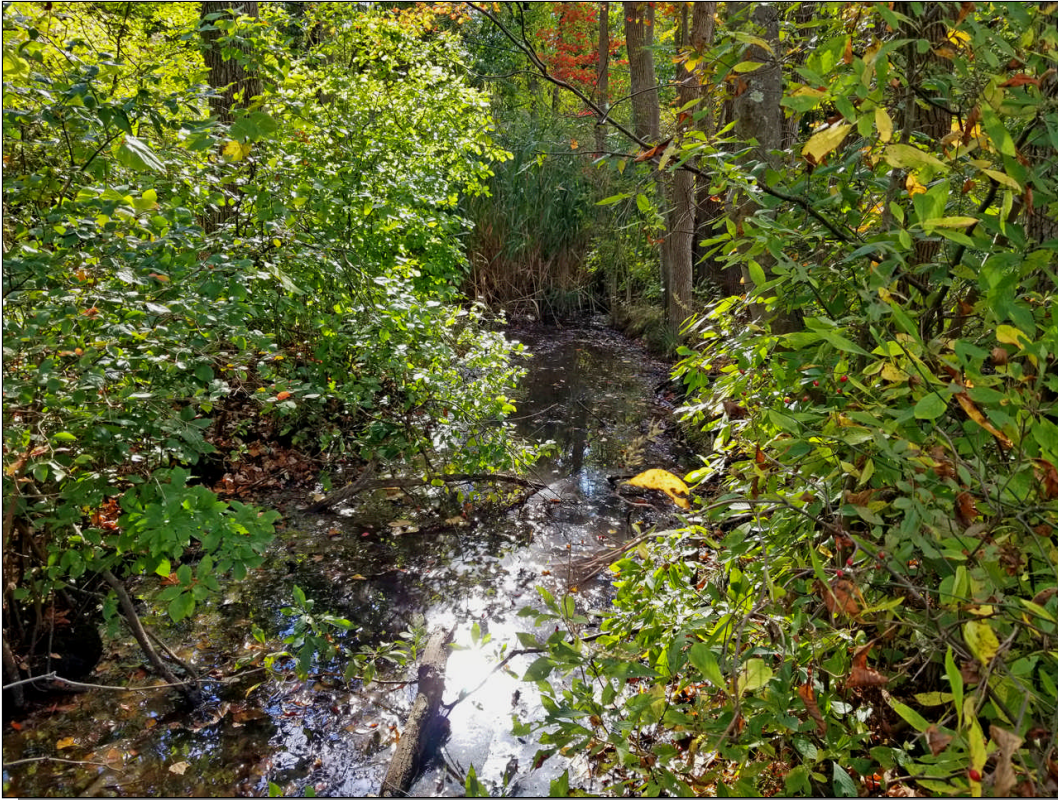
Photo 23B: Wetland B4; ditched watercourse draining swamp; facing southwesterly