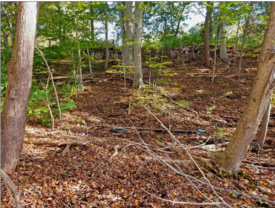
Photo 24B: Wetland B4, edge disturbance; eastern hillslope; facing easterly