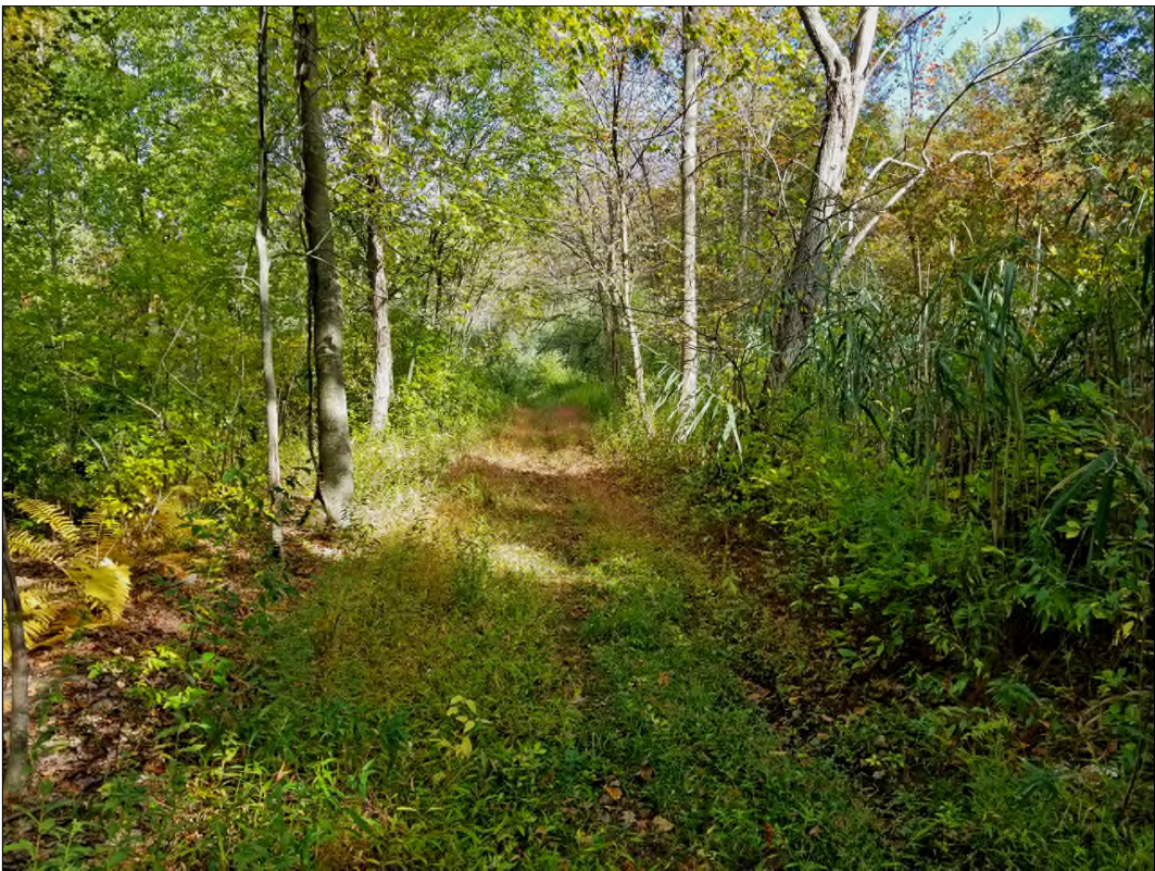
Photo 26B: Old abandoned access roadway separating Wetlands B5 and off-site wetlands to the south; also location of proposed wetland crossing; facing easterly