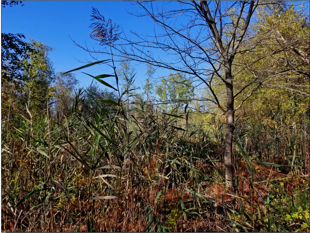
Photo 15B: Wetland B3; mosaic of Phragmites and young trees and shrubs; facing northwesterly