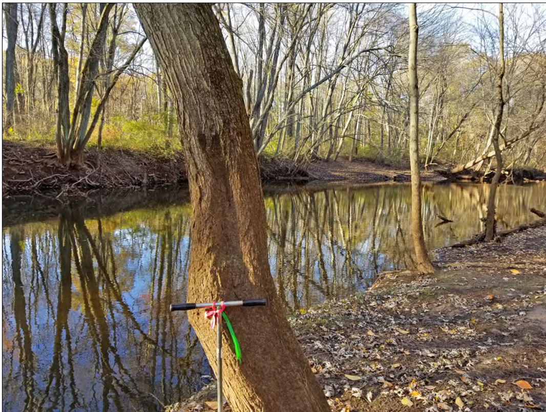
Photo 8A: Wetland A2 (MIRA Property); note silt staining several feet above soil auger, indicating flood level; facing northwesterly