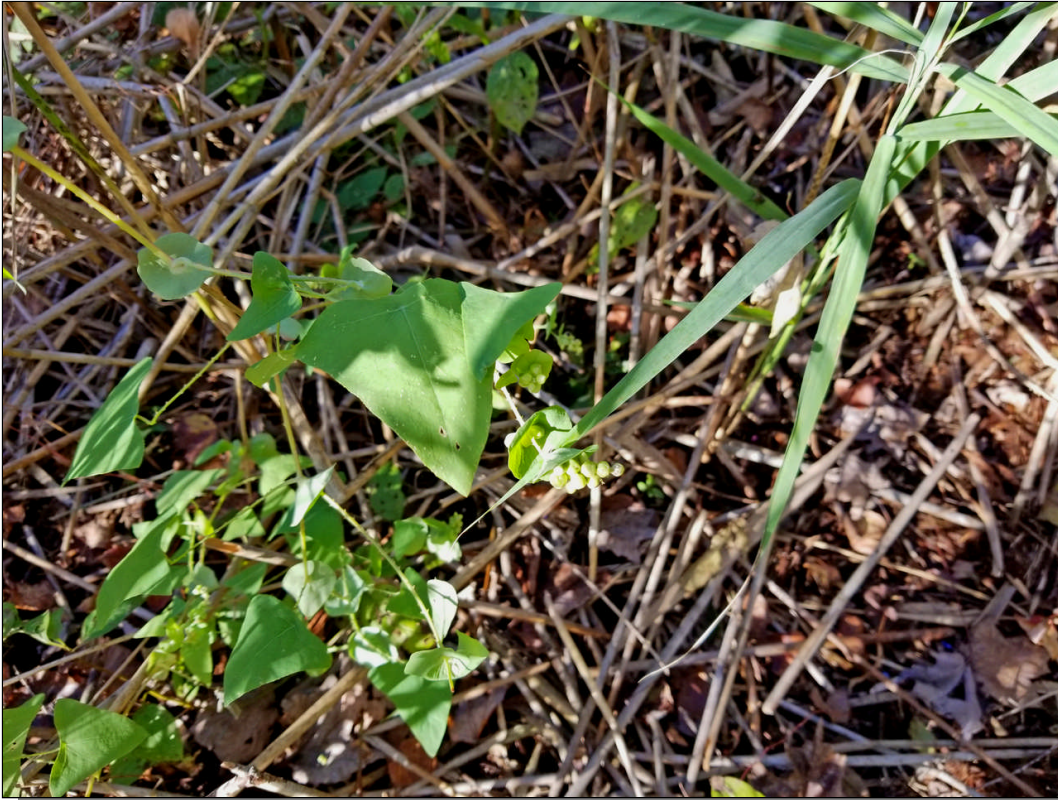
Photo 13B: Wetland B3, Mile–a-minute vine infestation in the wetland’s eastern section