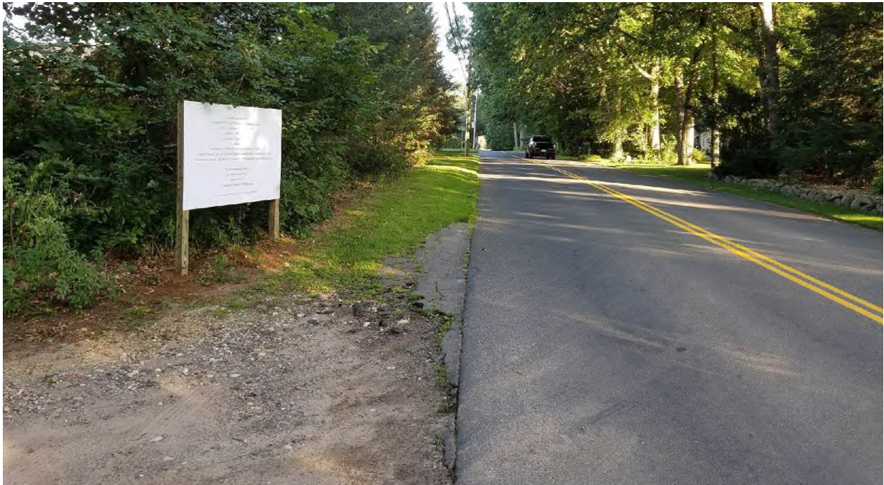
County Road adjacent to Munnisunk Brook