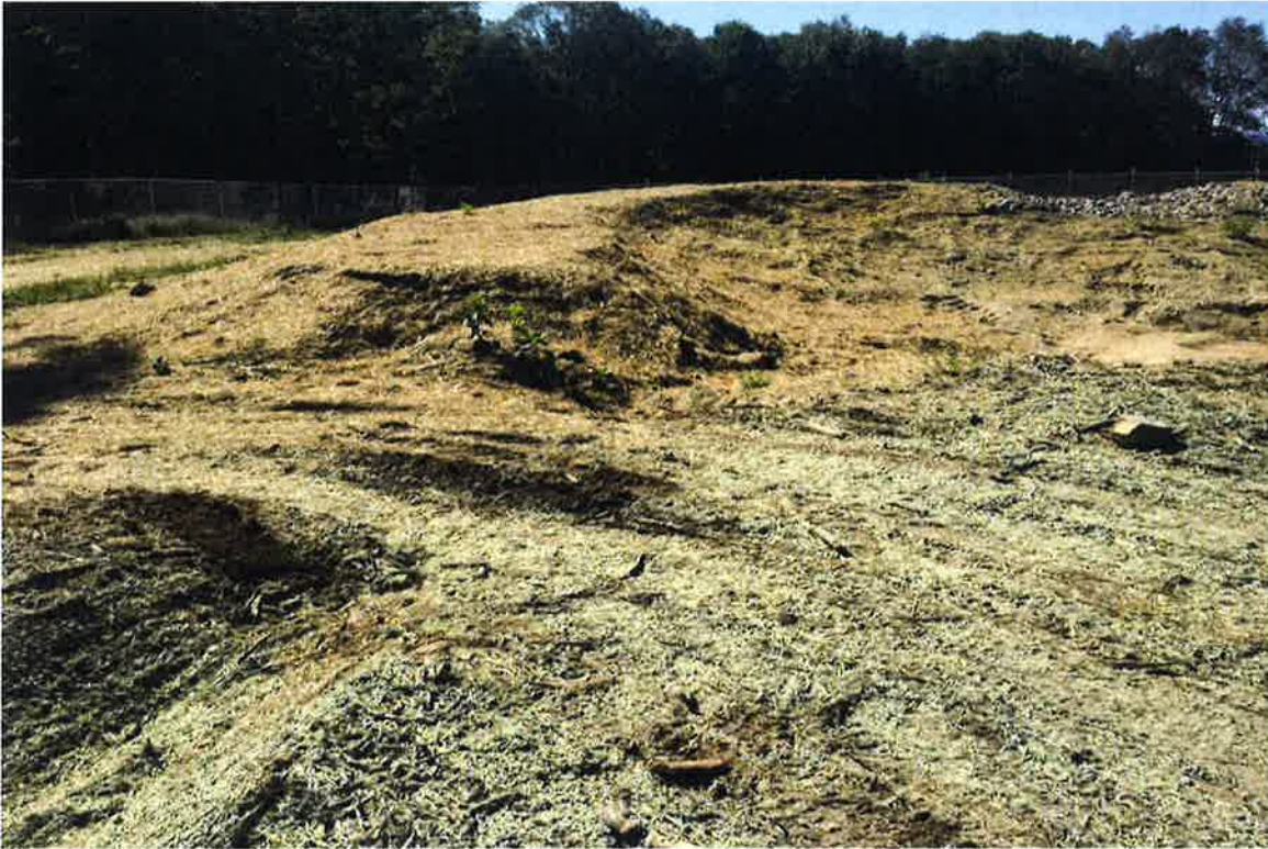
Photo 3: View of temporary diversion ditch to SB-2 tracked through and filled in.