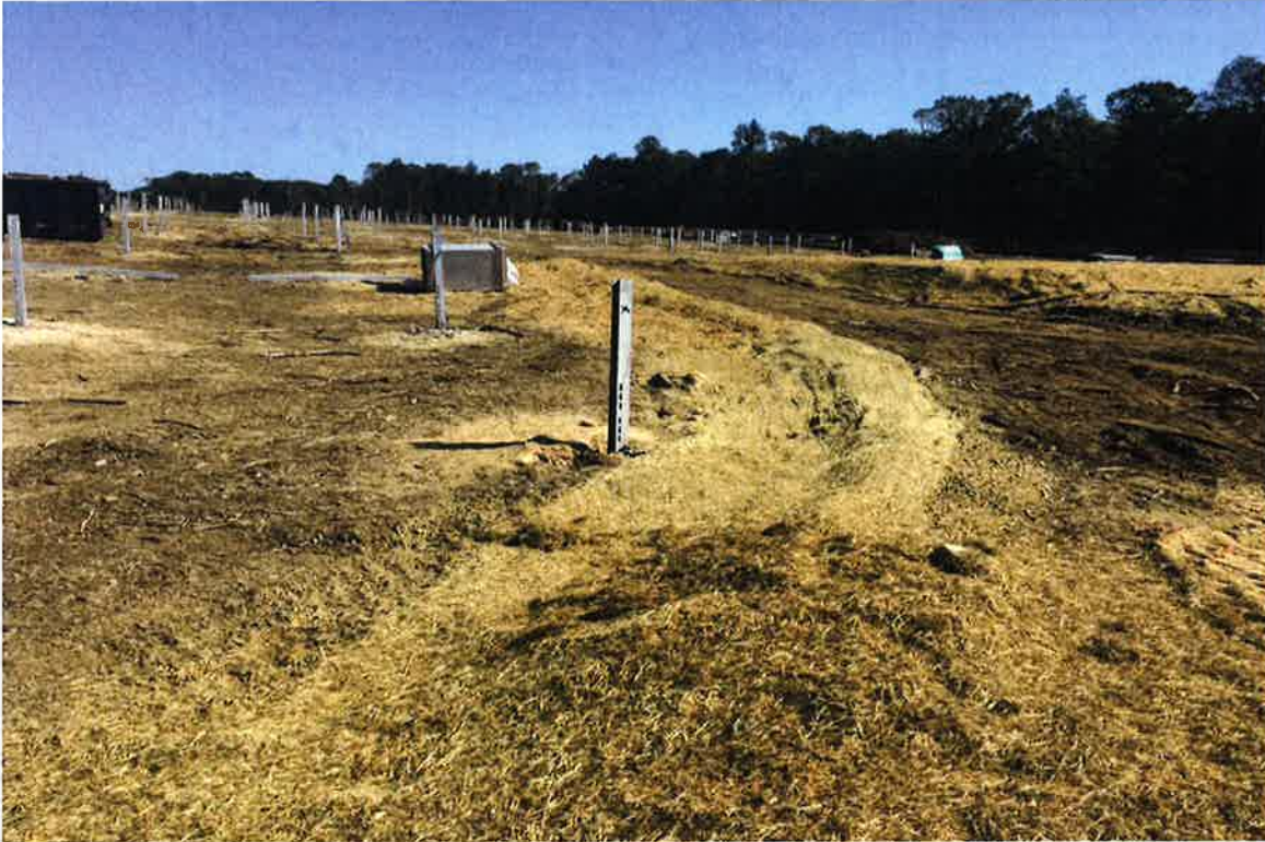
Photo 7: View of recently installed temporary diversion ditch to ST-13 looking north.