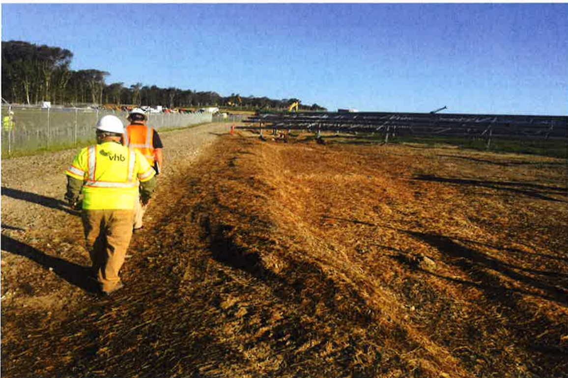
Photo 4: View of temporary drainage ditch along access entrance looking north.