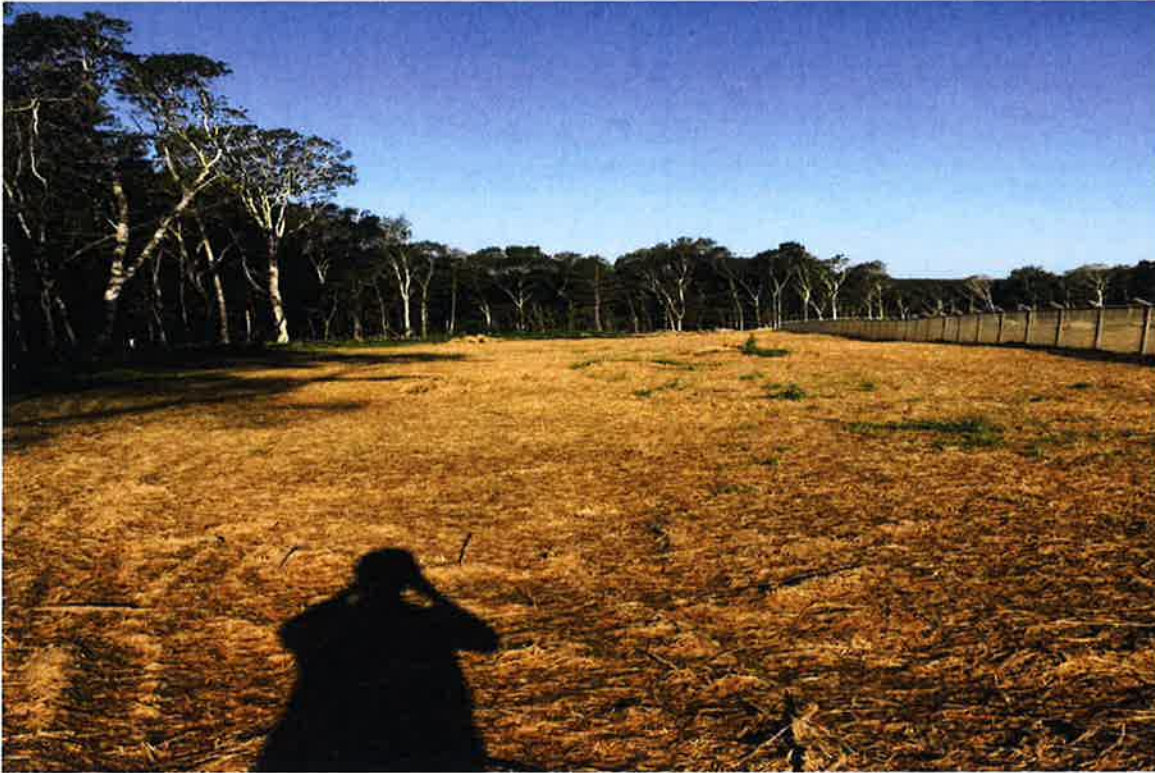
Photo 9: View of stabilized project peripheries areas looking north.