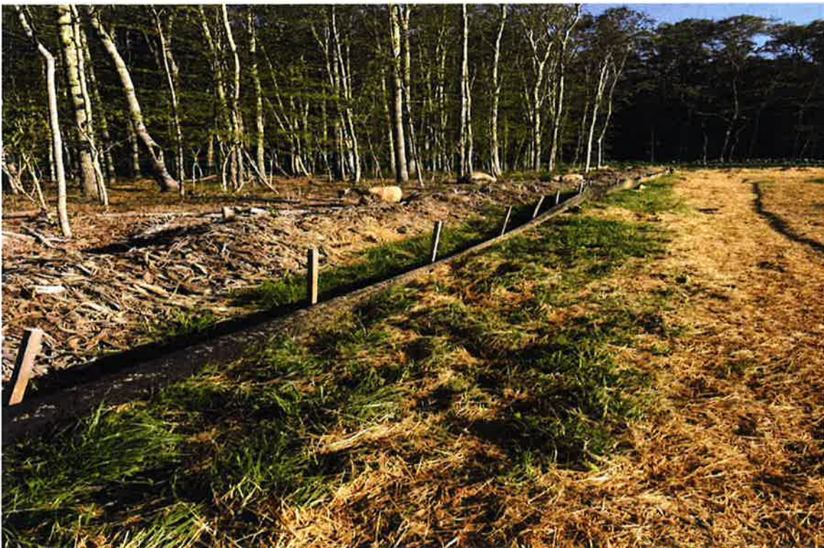
Photo 2: View silt fencing knocked down in northwest corner looking north.