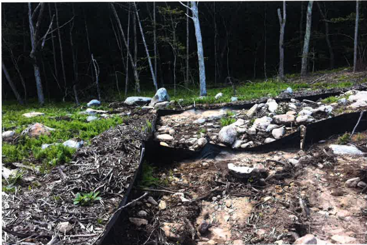
Photo 5: View of CA #12 consisting of silt build-up and silt fence failure, looking west.