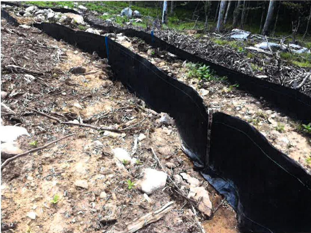
Photo 7: View of CA #12 and areas adjacent to silt fence draining to CA #12, looking southwest.