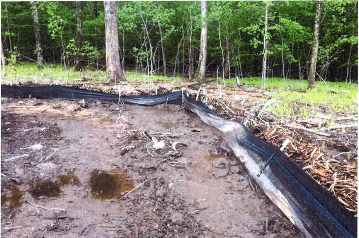
Photo 5: View of silt fence corner noted needing clean-out looking southwest.