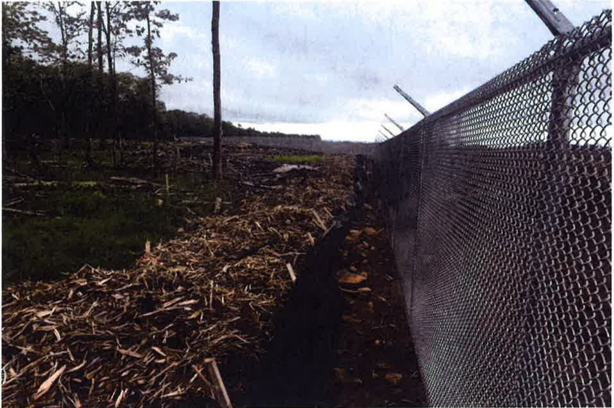
Photo 3: View of silt fence knocked over during permanent fence install (CA #11), looking south.