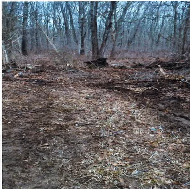
Photo 8: View of brush pile removed northern tip of wetlands in southeast portion of property looking south.