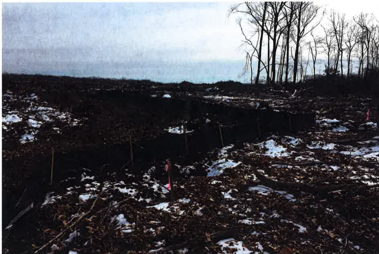
Photo 5: View of western project limits of silt fence install looking north.