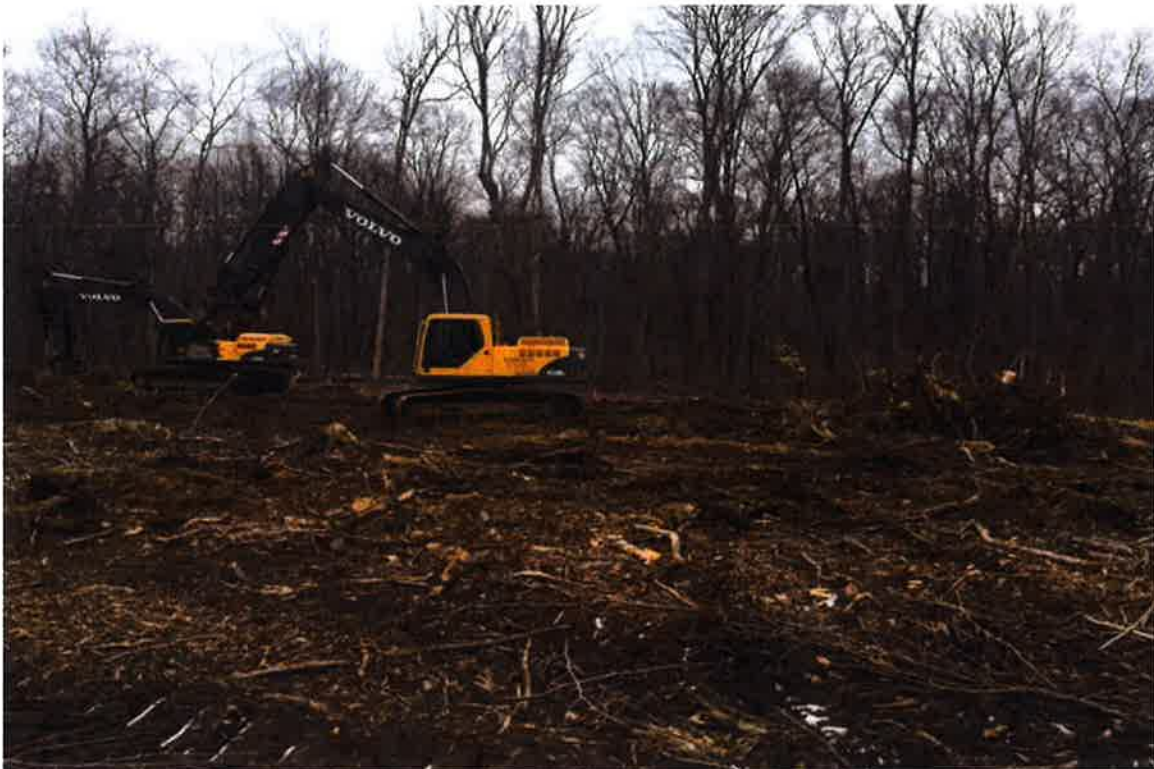
Photo 6: View east of cleared area with initial grubbing work in preparation of silt fence installation.