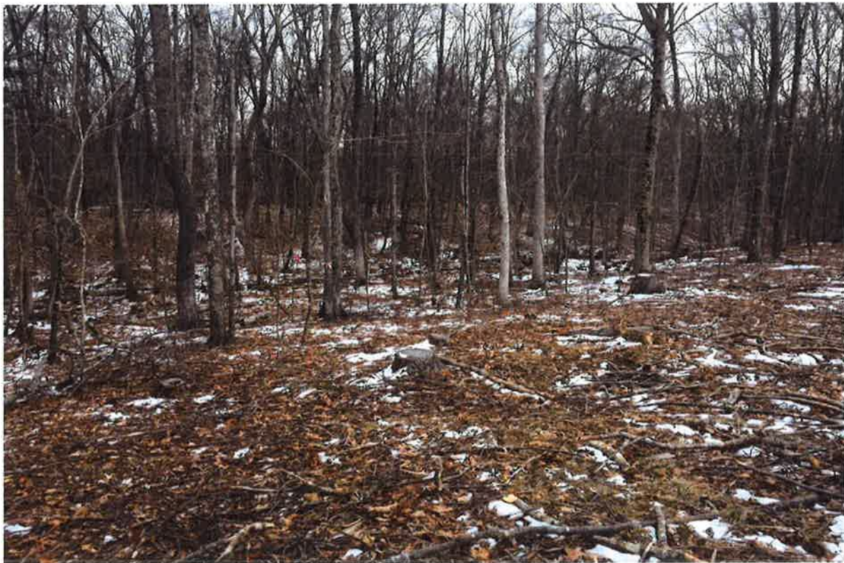
Photo 4: View of typical clearing limits for shadow effect looking south.