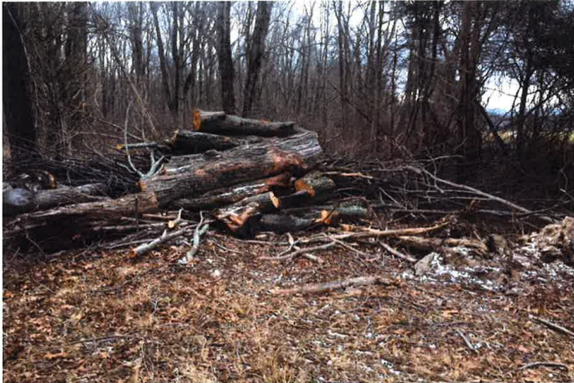
Photo 7: View of brush pile at northern tip of wetlands in southeast portion of property looking south.