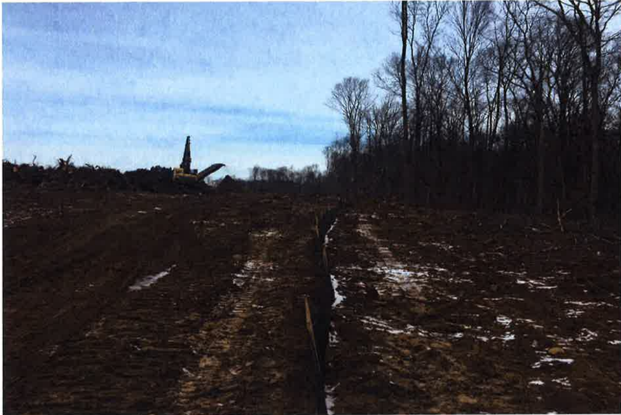
Photo 1: View of silt fence installed along eastern project boundary looking north.