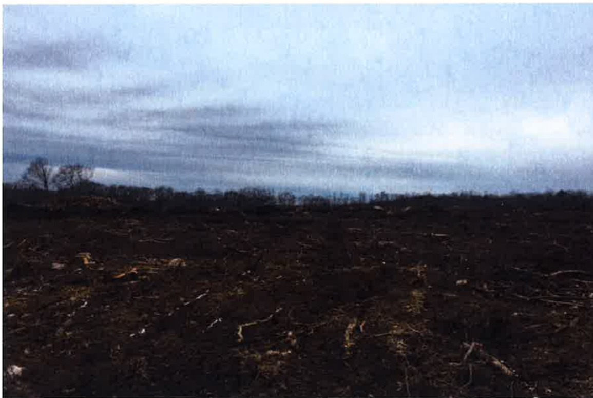
Photo 3: View west of cleared area; clearing work 50 to 60% complete.