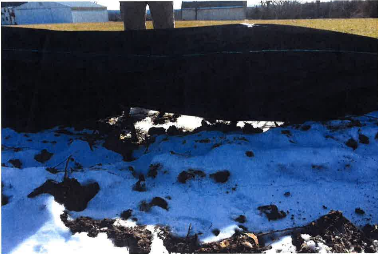
Photo 7: View of CA#3 silt fence not trenched in requiring repair.