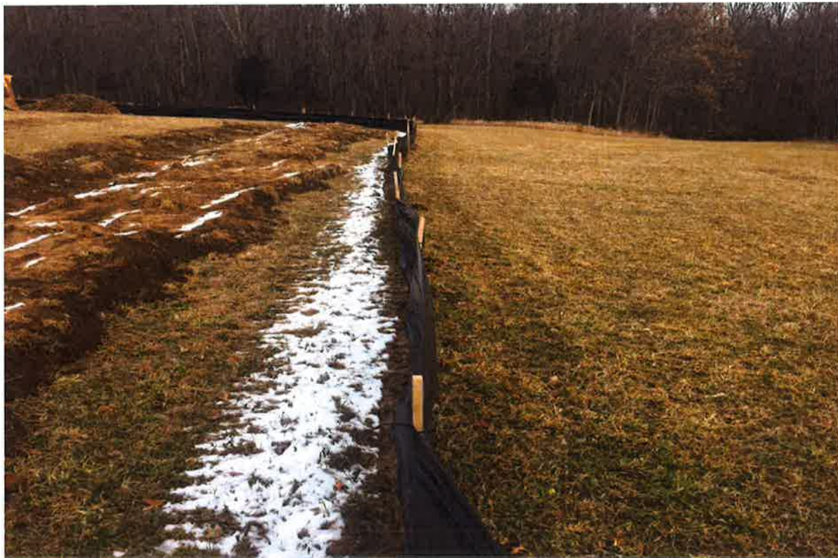
Photo 2: View of silt fence install along southeast project boundary looking northeast.