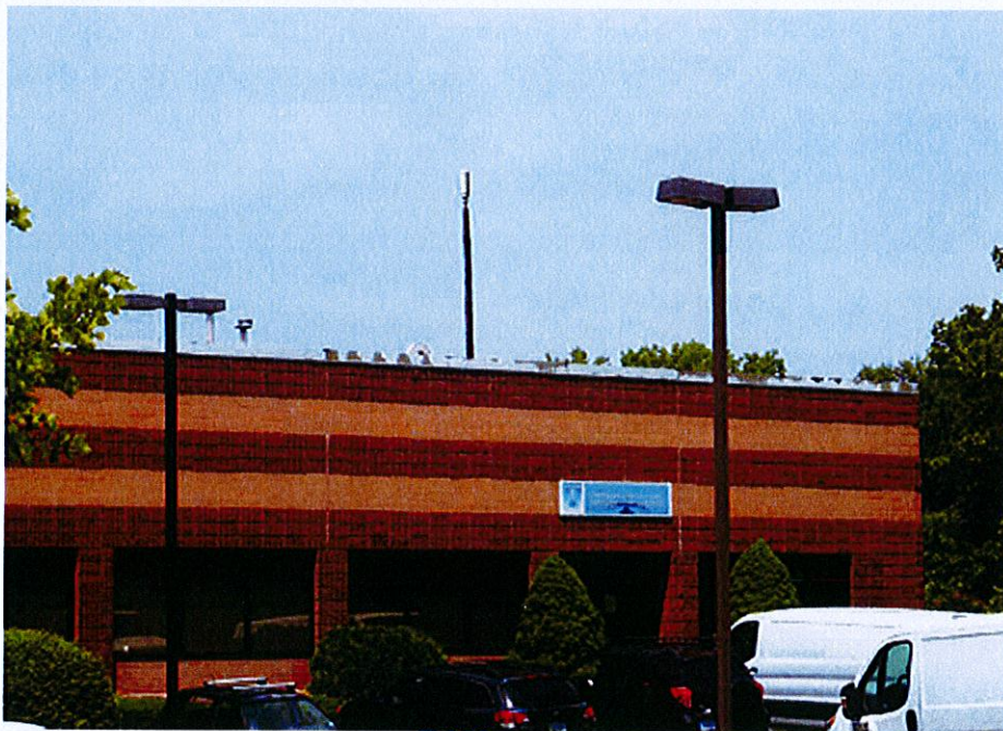
Photo simulation of canister antenna on existing wood pole.

The proposed small cell installation would have no significant adverse visual impact as it is mounted on top of an existing wood pole located in a commercial area.