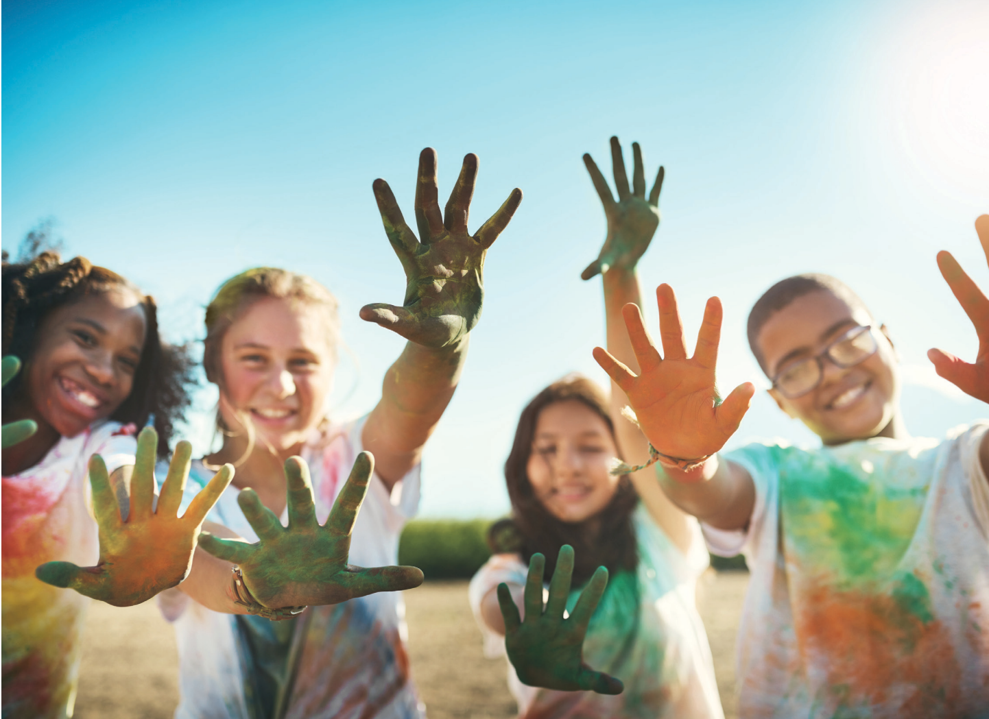
📌 The Connecticut State Department of Education launched its Summer Enrichment Initiative in Spring 2021, to provide Connecticut students opportunities for socialization and fun as the state eased its pandemic restrictions. The Connecticut COVID-19 Education Research Collaborative commissioned an evaluation study of the Summer Enrichment Initiative in July 2021 as camps were underway.