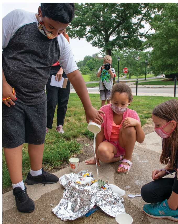
Students create volcano at a summer camp held at UConn in 2021.