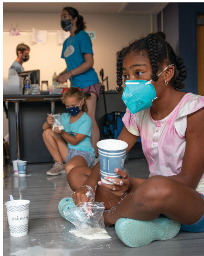
Students make Oobleck at a summer camp held at UConn in 2021.

Supervisors and students viewed camp staff positively. Students' relationships with camp staff played a central role in students' camp experiences. At the same time, many supervisors indicated they had difficulty fully staffing their programs and also expressed the need for more targeted training for staff on how to support students' social emotional learning and well-being. The CSDE could solicit insight from camp providers on how they recruited and trained staff to provide guidelines and information for future summer initiatives. CSDE could also partner with camp providers to help identify and provide this training.