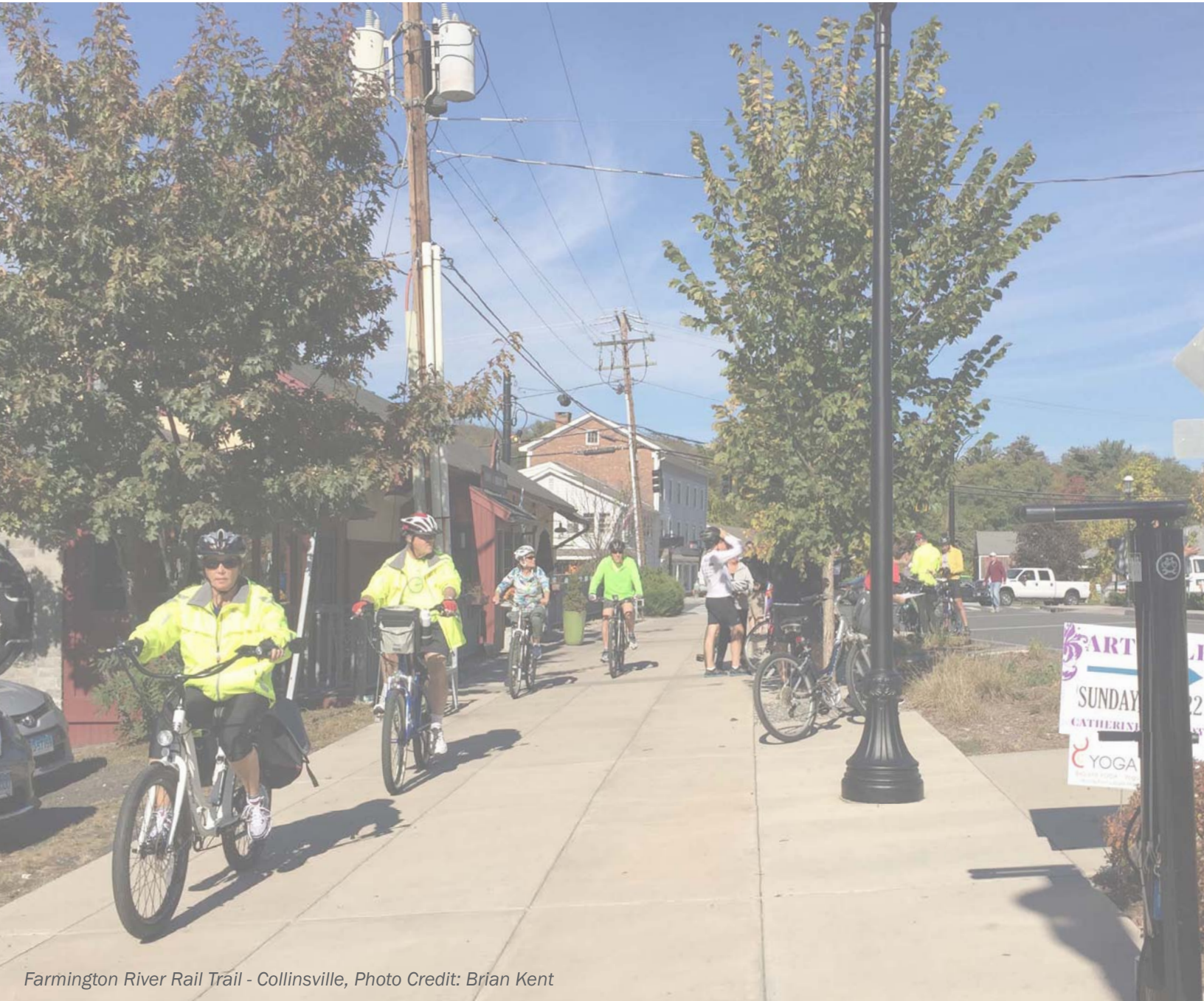
Farmington River Rail Trail - Collinsville