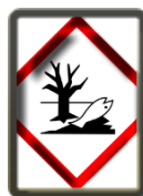
ix. Environmental Toxicity

c. Transportation pictograms (these will be on shipping containers):