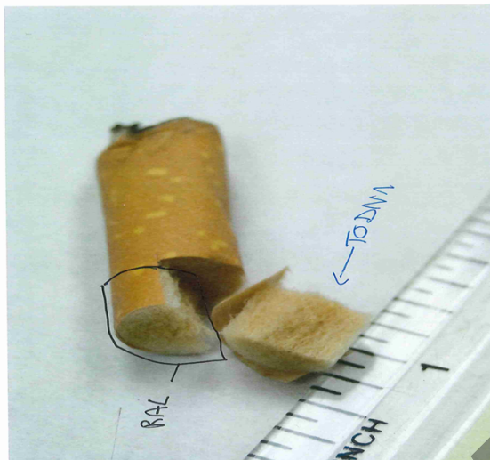
Figure 1: Correct equal portions