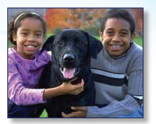
Family photo with pets