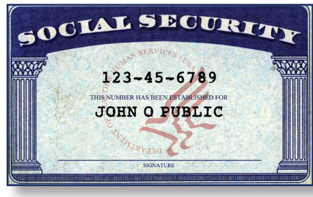
Social Security Card