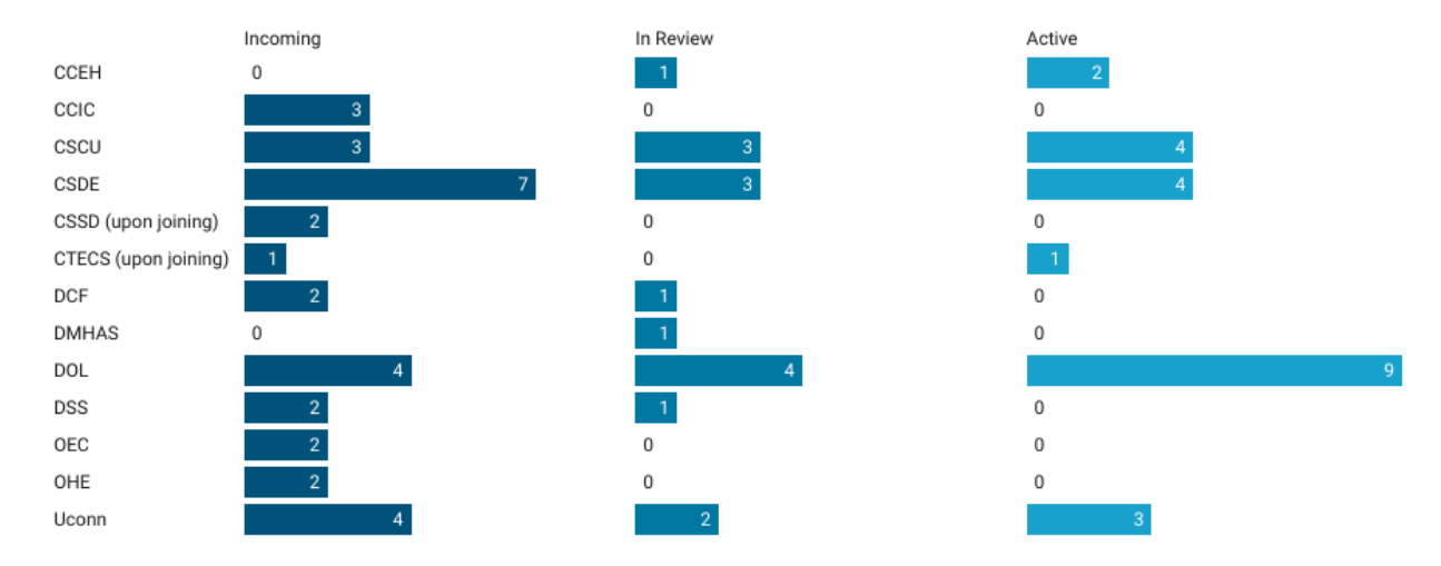
Section 4: Expansion of Data

Furthermore, each P20 WIN request must involve data from at least two participating agencies. Please see the graph below for how many projects that each participating agency is involved with, and in which of the various stages of the P20 WIN process these projects are in.