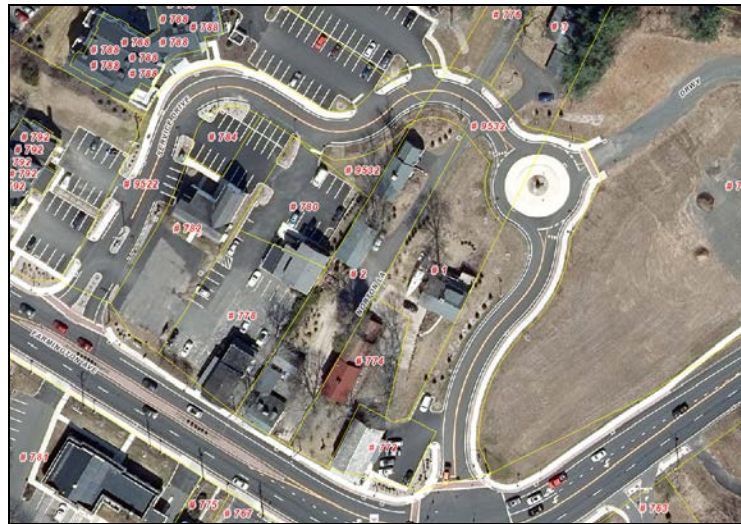
Farmington GIS Mapping

RECOMMENDATION: Staff recommends approval of the Release for the following reasons: