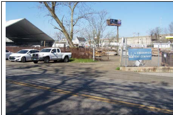
View of Proposed Acquisition Area Looking Southwesterly Toward Subject Property

The drainage right of way is mostly rectangular in shape and has a width of 25± feet. The average length of drainage right of way is estimated at 94.35 feet. The purpose of the drainage right of way is to install and connect a 24 inch diameter storm sewer force main to an existing 42 inch reinforced concrete pipe located on the subject property. The piping will be connected by a proposed doghouse manhole which will be installed on the subject property.