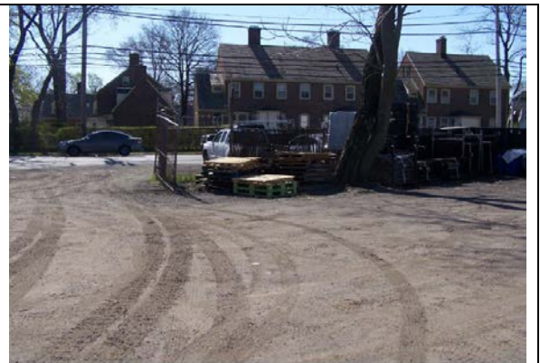
Interior View of Subject Property Looking Toward Proposed Acquisition Area

SITE DESCRIPTION: The subject property consists of an unimproved parcel of land containing 0.7852± acre or 34,202± square feet per survey. The property is irregular in shape with 281.36± feet of frontage along the northwesterly side of South Avenue. The property additionally benefits from 367.16± feet of frontage on Cedar Creek along its rear boundary. The frontage along Cedar Creek includes an older dock with pilings. It is noted that the subject property is located within the AE flood hazard area as determined by flood mapping which is within the 100 year flood zone.