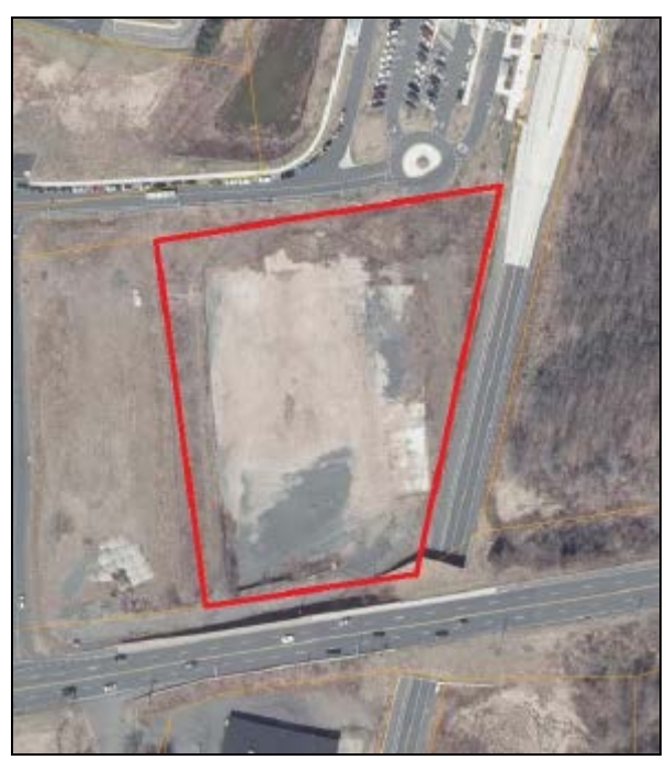
Newington GIS Map