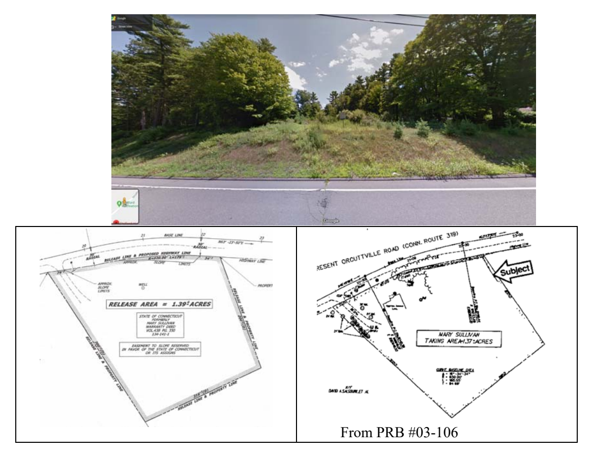
Valuation – An appraisal was prepared by DOT appraiser Edward P. Sass, Jr as of December 21, 2017. Based on the sales comparison approach, three lots sales in Stafford were considered, and the appraiser concluded that the fair market value of the release parcel was $25,000.