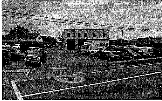
View of 541 New Haven Avenue, Milford

The property is located in the CDD4 Corridor Design Development zone and is a pre-existing non-permitted use.