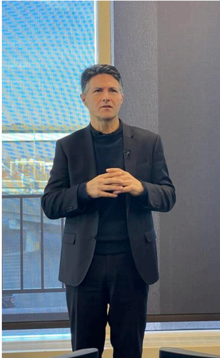
Above: Victor Dominello, Former Minister for New South Wales, Australia

On December 8th, DAS hosted a leadership-level meeting on Connecticut's digital journey, which featured Victor Dominello, the former minister for customer service and digital government for the government of New South Wales, Australia. Dominello is a highly renowned expert in the space of digital government and shared his insights with our departments as Connecticut progresses in its journey to an all-digital government.