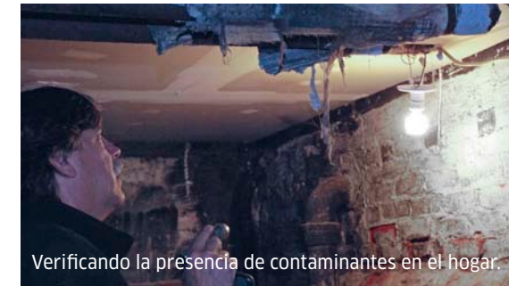
Verificando la presencia de contaminantes en el hogar.

Si usted ha recibido servicios de acondicionamiento bajo el Programa de asistencia en acondicionamiento (Weatherization Assistance Program) del Departamento de Energía de los EE.UU. desde el 30 de septiembre de 1994, no cumple con los requisitos para participar en la CTEHHI.