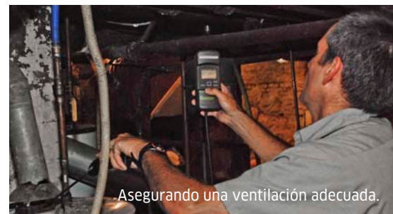
Asegurando una ventilación adecuada.

La CTEHHI es un programa estatal comunitario llevado a cabo en colaboración con el Fondo para el uso eficiente de energía, compañías de servicios públicos asociadas y compañías de atención médica, municipales y sin fines de lucro asociadas de todo Connecticut.