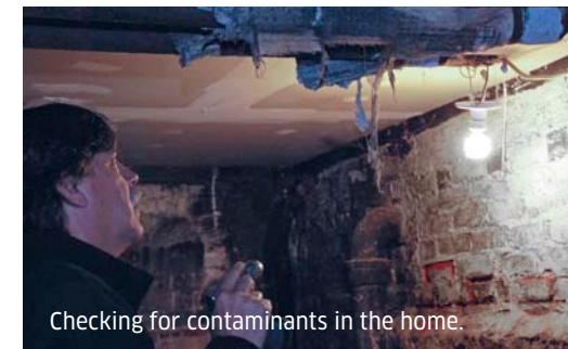
Checking for contaminants in the home.

If you have received weatherization services under the U.S. Department of Energy Weatherization Assistance Program since September 30, 1994, you are not eligible to participate in CTEHHI.