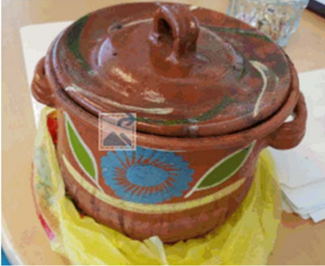
clay pot - used to prepare rice and beans (cooking over several hours)

During the last year, we saw many “alternative” samples submitted to the DPH State Lab that were considered to be potential source of lead exposure. Below is a collage of some of the unique samples.