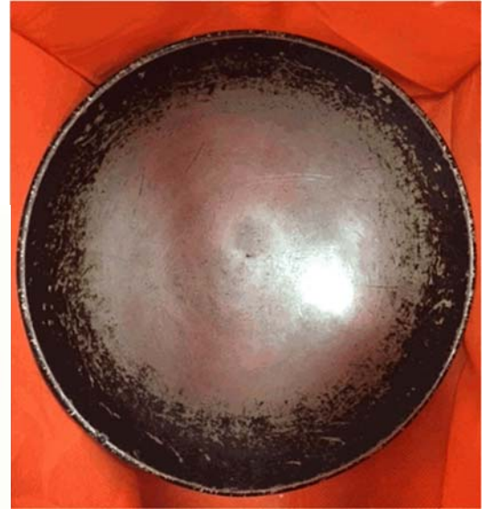
metal bowl - used to prepare child's food