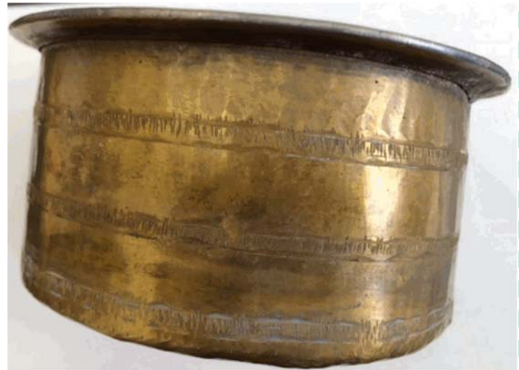
metal bowl from India - used to cook and serve child's food