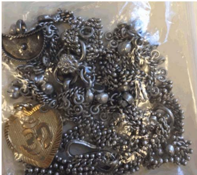
gold plate necklace from India