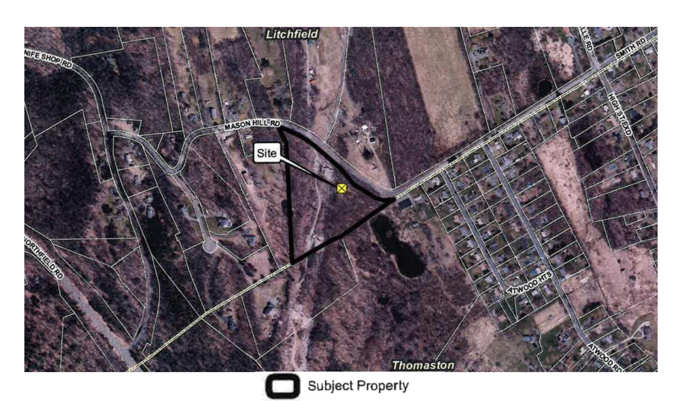
Figure 1 – Approximate Site Location