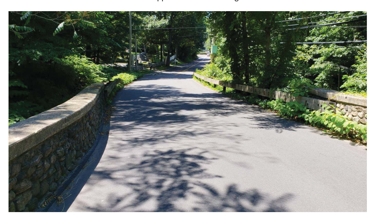
2. West approach from the bridge.