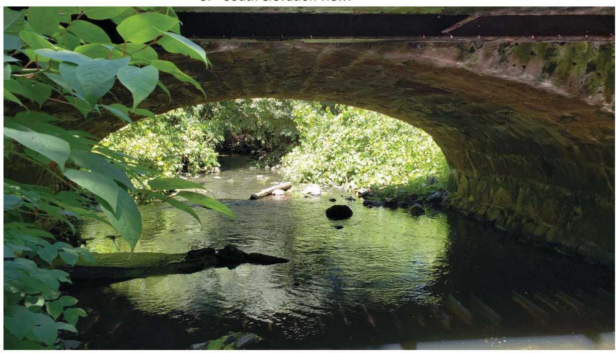
4. South elevation of bridge.