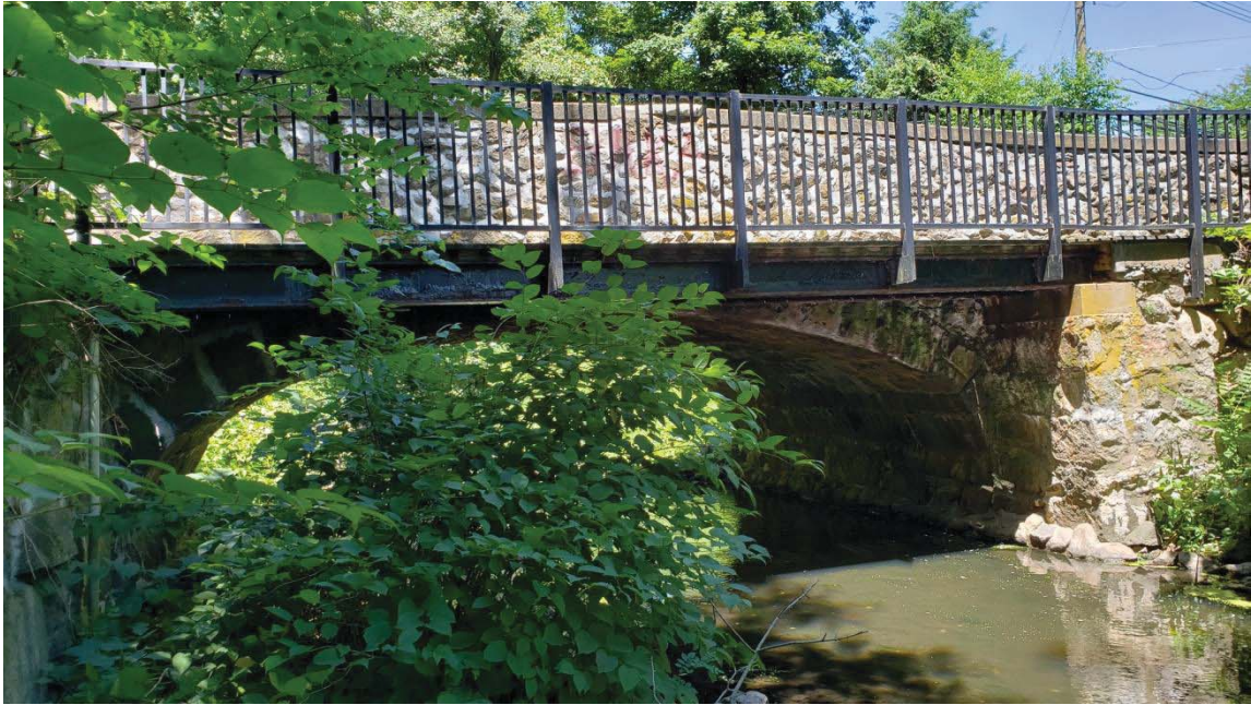
3. South elevation view.