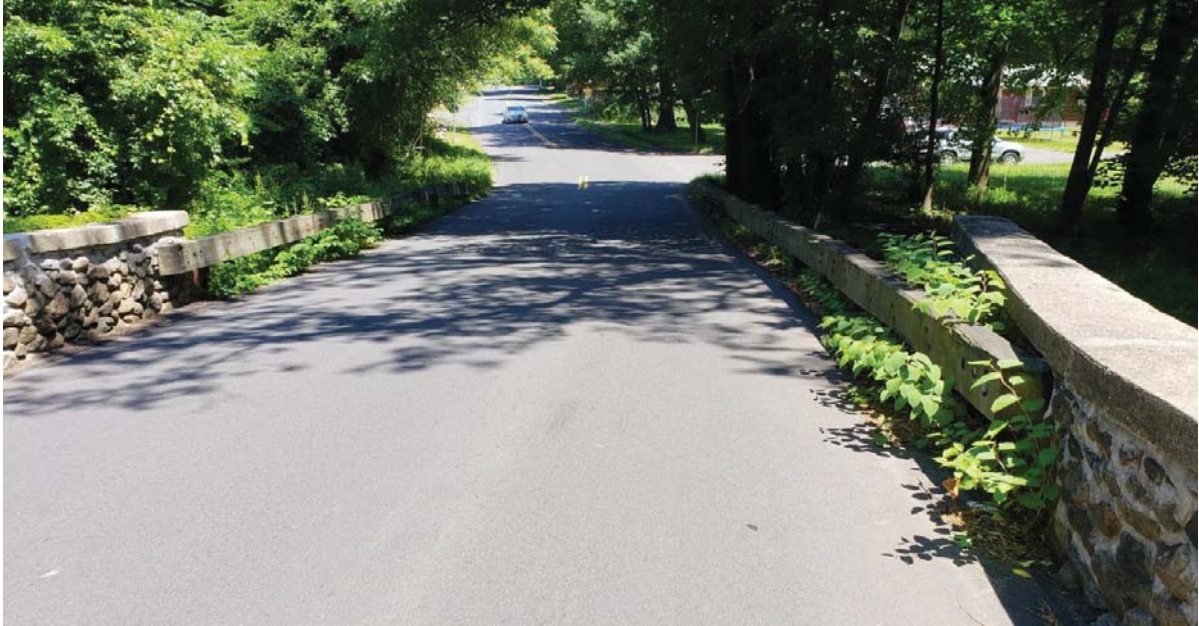
1. East approach from the bridge.