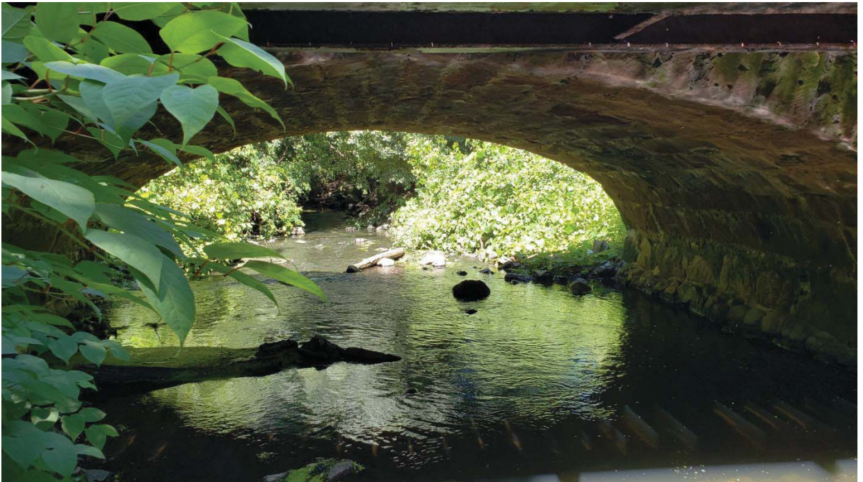
4. South elevation of bridge.