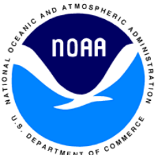
U.S. National Weather Service