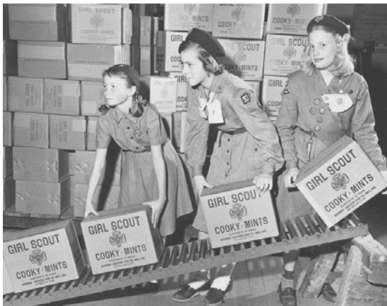
Untitled, circa 1950

For 95 years, Girl Scouts have sold cookies to finance troop activities. In 2008, Thin Mints were voted Connecticut's favorite cookie.