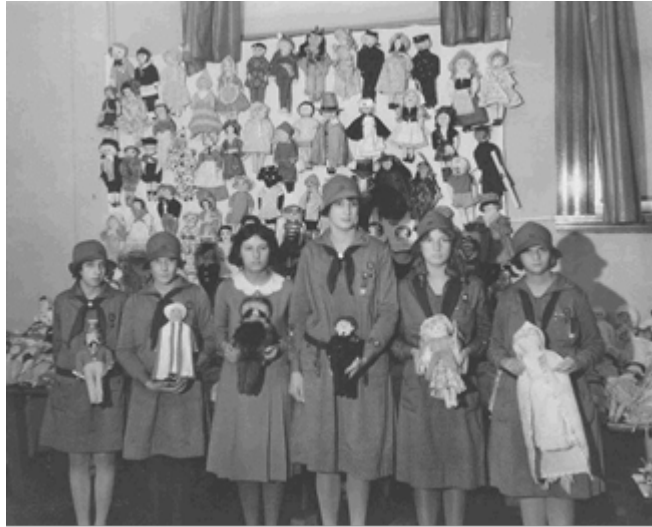
Hartford Council Dolls, November 1932

Vincent's Hospital in Bridgeport was one of the first hospitals to let Senior Scouts volunteer as junior hospital aides. Though hospitals were at first wary of letting Girl Scouts volunteer, the shortage of nurses and the success of the scouts in Bridgeport soon had hospitals nationwide requesting that Girl Scouts volunteer at their local hospitals. By 1945, eighty-one former Hartford Girl Scouts had entered the war service. Soon after the end of the war in 1945, the Girl Scouts were sending aid to refugee children and sending trained Girl Scouts to help in liberated areas.