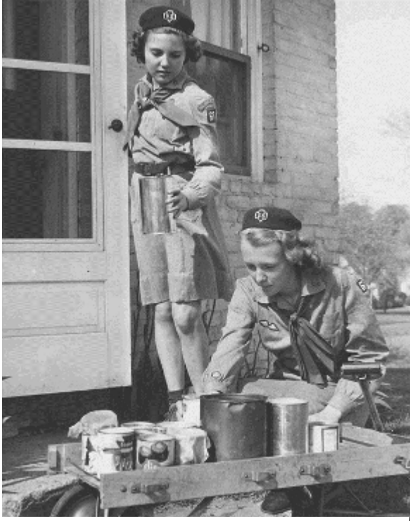
From Parade of Youth magazine, June 1946 Courtesy of Girl Scouts of Connecticut

During World War II, Connecticut Girl Scouts collected waste kitchen fats for the war effort, which were used to grease guns and make soap.