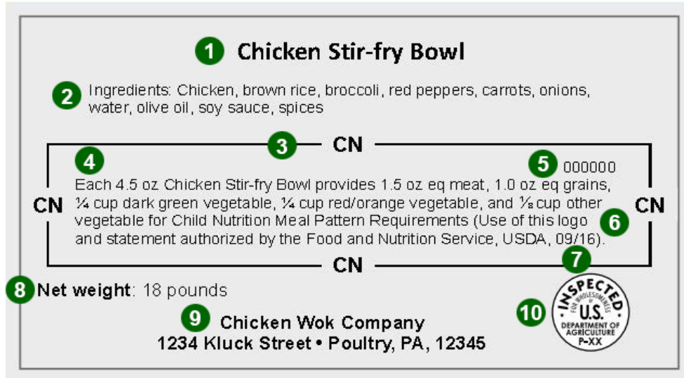
Figure 1. Sample CN label

CSDE's training program, What's in a Meal: National School Lunch Program and School Breakfast Program Meal Patterns for Grades K-12 .