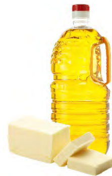
Table 4-1 shows examples of types of fats.