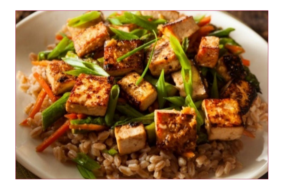
Table 3-9. MMA contribution of tofu