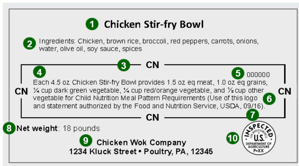
Figure 6-1. Sample CN label

Figure 6-1 shows an example of a CN label and the required elements. For training on CN labels, refer to Module 6: Meal Pattern Documentation of the CSDE's training program, What's in a Meal: National School Lunch Program and School Breakfast Program Meal Patterns for Grades K-12 .