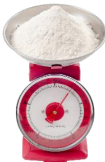
Table 5 shows how to use method 2 to calculate the oz eq for a standardized recipe for multi-grain bread that lists the weight of the grain ingredients. Bread is in group B of the USDA's Exhibit A chart and requires 16 grams of creditable grains to credit as 1 oz eq of the grains component. To credit as 1 oz eq of a WGR food, the 16 grams of creditable grains must include at least 8 grams of whole grains.