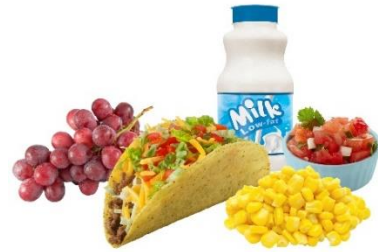
Table 4. OVS lunch and supper requirements for at-risk afterschool centers

The CACFP at-risk afterschool center must offer the full serving of all five food components. Children must select the full serving of at least three components for a reimbursable meal. Table 4 summarizes the OVS requirements for lunch and supper.