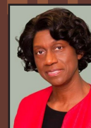
Charlene M. Russell-Tucker Commissioner of Education