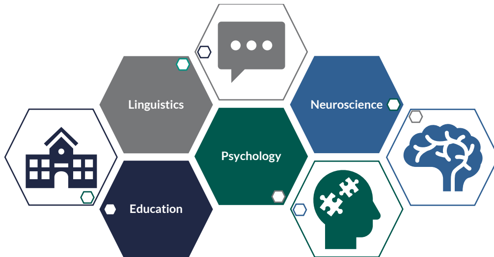
Figure ES 1: Research Areas within the Science of Reading

Source: University of Florida Literacy Institute 8