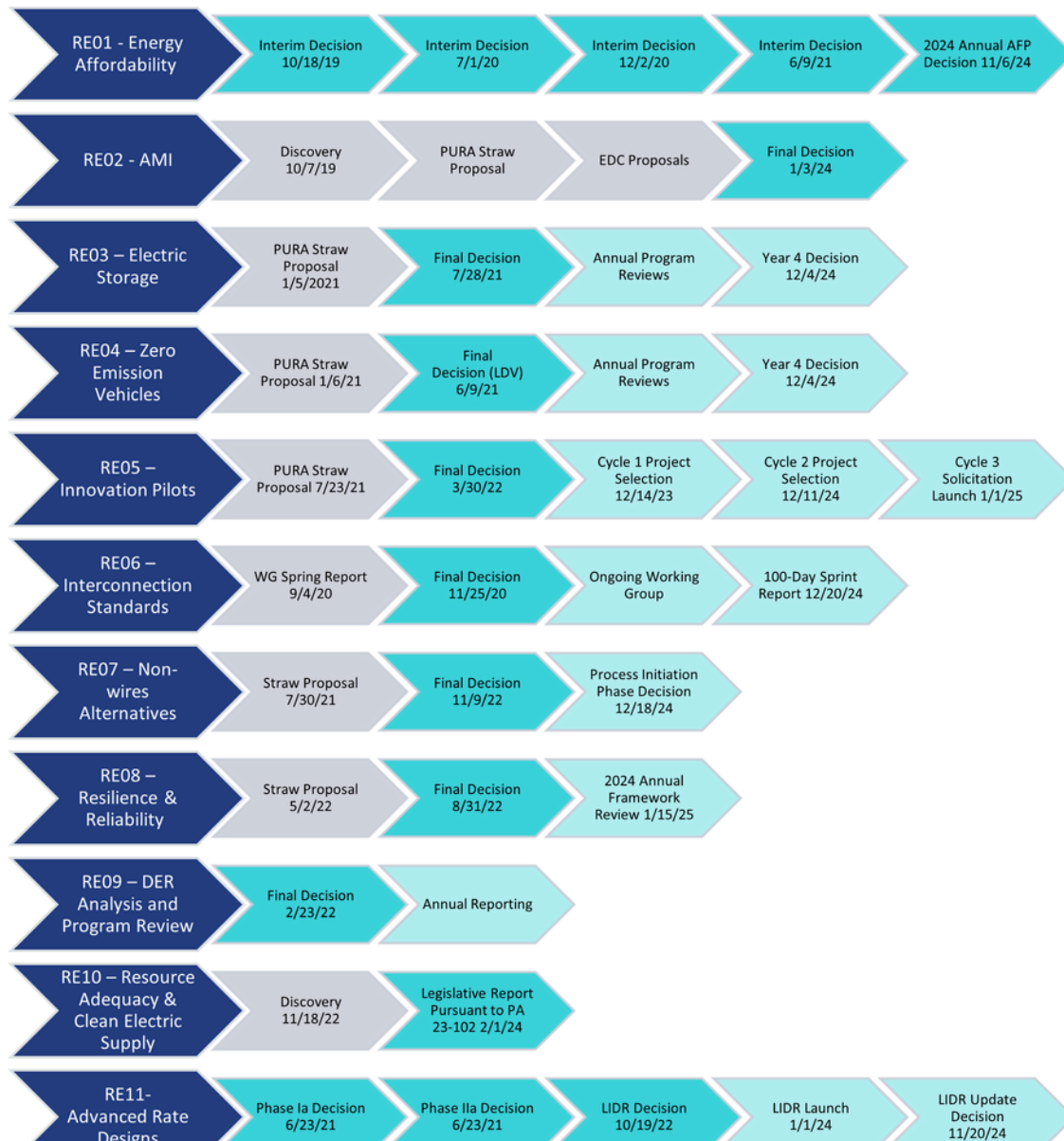
Figure 7: Progress Across EMG Reopener Dockets

A docket that is initiated to either reassess or continue evaluating a specific part of the original docket's decision. It helps to maintain continuity between related dockets. "Reopened" proceedings use the naming convention "###-##-##re0#" in PURA's docket database.