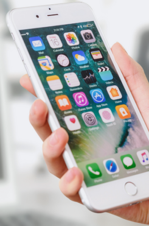
State of Connecticut Office of The Victim Advocate