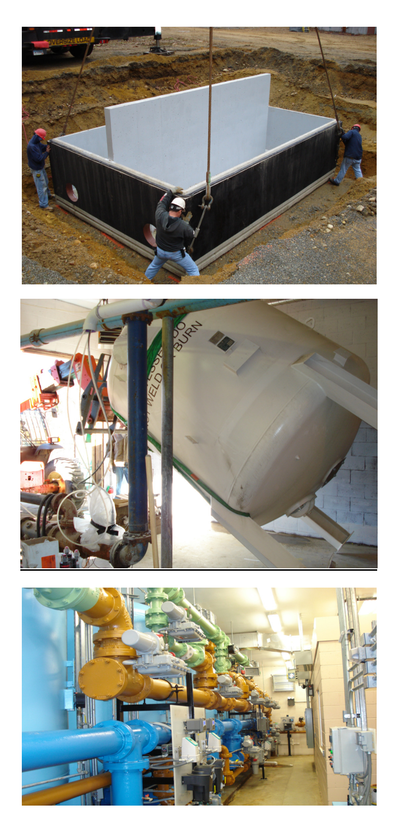
Town of Colchester - Sewer & Water Commission - Water Treatment Plant