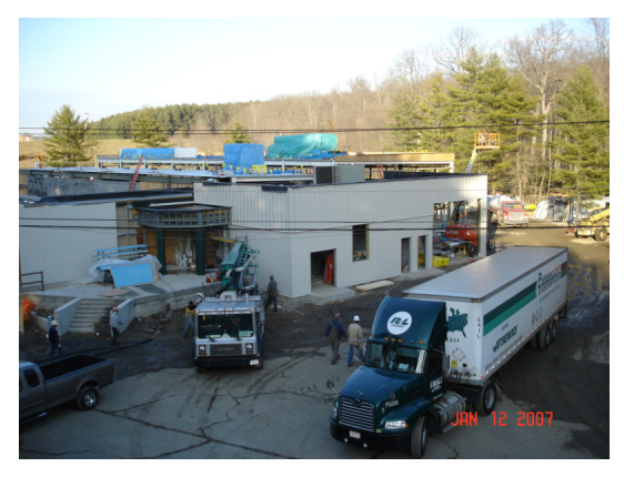
South Norwalk Electric and Water - Water Treatment Plant