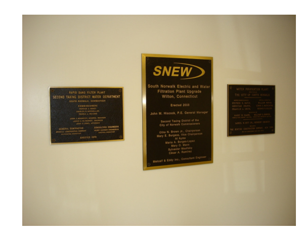
South Norwalk Electric and Water - Water Treatment Plant