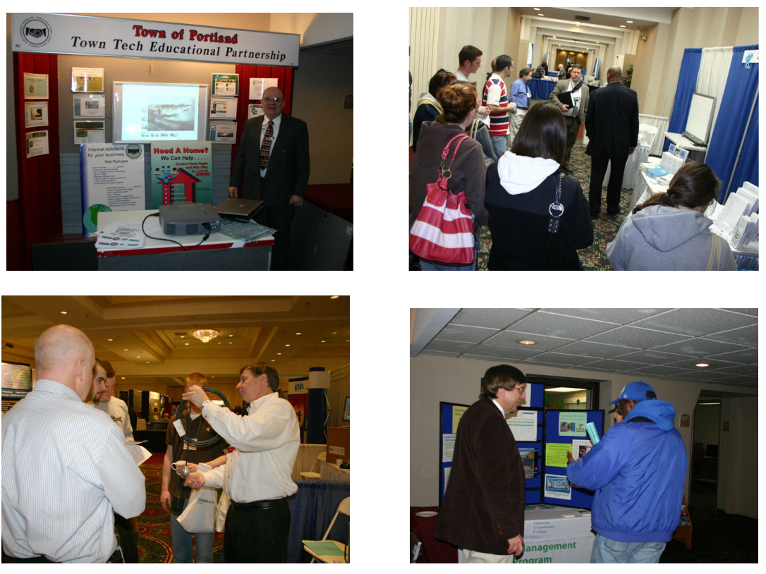
Participants and exhibits - ATCAVE 2009