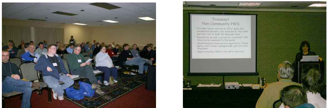
Participants during ATCAVE 2009 sessions