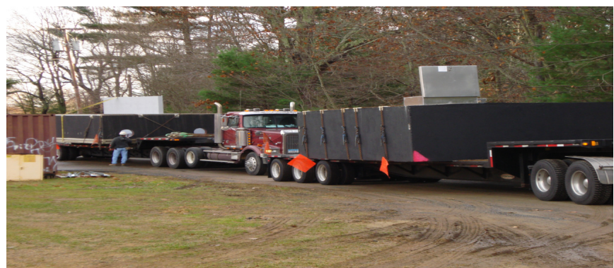
Work progresses at the Colchester facility

This $2.6 million project is for water treatment plant upgrades and modifications. The previously existing pump and treatment facility did not have the capacity to meet peak water systems demands. The level of iron in the previously produced water came from wells, which resulted in the decrease operational capacity of existing filters as well as decreased water quality. The population served by this water system is approximately 4,000.