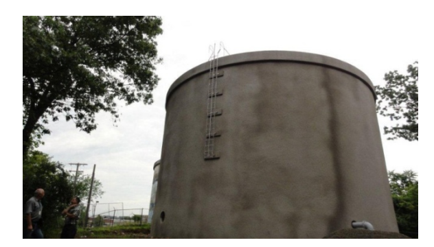
Town of Portland Water Storage Tank

This project consists of demolition and replacement of a structurally deficient 500,000 gallon concrete water storage tank on High Street, adjacent to the Portland Middle School. In addition, masonry repairs and painting will be done on the one million gallon concrete water storage tank at the same location. This project closed on its permanent loan of $975,033 on January 31, 2012.