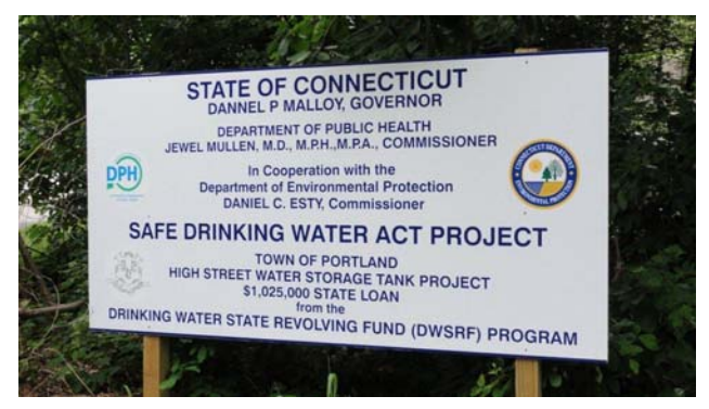
Town of Portland Project Drinking Water SRF Sign