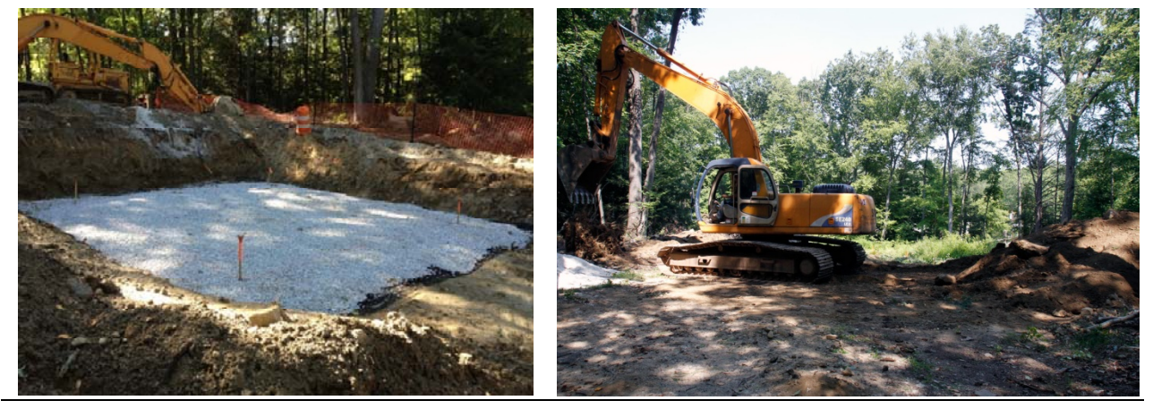
Candlewood Trails Association – Excavation for new pump house project

The Candlewood Trails Association is located on Candlewood Lake in New Milford, CT. This project consists of the design and construction of a new pump house, new well pumps, VFDs, installation of a buried 250,000 gallon atmospheric storage tank, and appurtenances to utilize two new wells which were drilled in 2004. The need for continuous chlorination will be eliminated with the use of the new wells. This project closed on an Interim Funding Obligation to provide the amount of $526,290 on May 1, 2012. The interest rate for this loan was 2%.