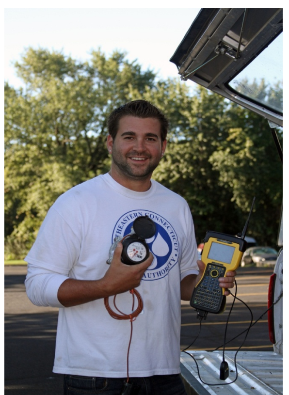
SCWA staff with a Radio Frequency Water Meter

This project's Interim Funding Obligation closed on June 5, 2012. Of the total project financing, the loan amount was $158,059 at an interest rate of 2%.