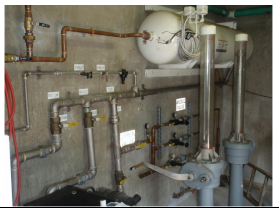
Aeration Supply System – Intake Building

City of Meriden – Broad Brook Water Treatment Plant & Pump Station Improvements ($2,008,997) (design phase)