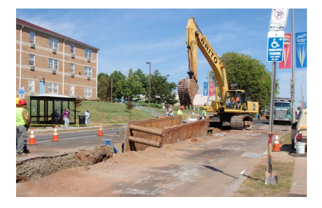
MDC – Water Main Installation Project – Main Street, Hartford