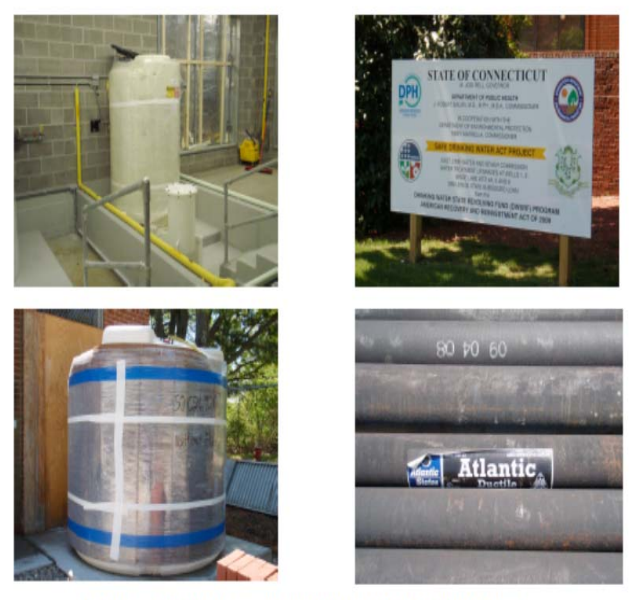
East Lyme construction - chemical storage tanks and water piping.