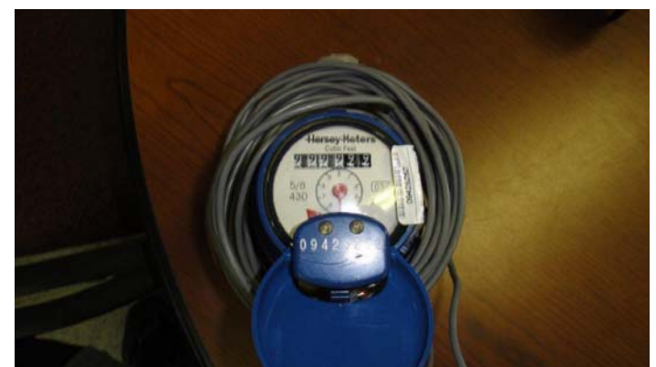
MDC smart meter

This project also satisfied the ARRA Green Project Reserve requirements. This project closed on the permanent loan on August 31, 2011.