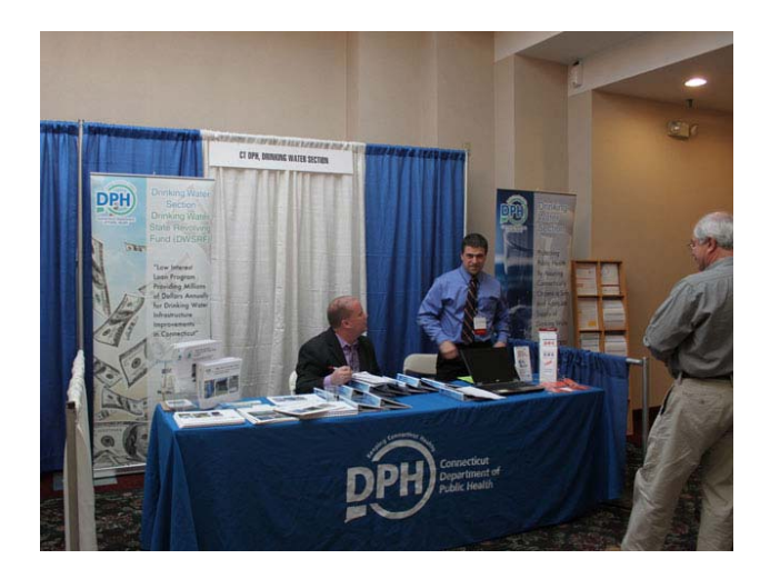
DPH Drinking Water Section staff at ATCAVE

DPH Drinking Water Section staff participated as instructors, and staffed the DPH Drinking Water Section information booth. This workshop has become very successful and is one of the more important events in which the DPH Drinking Water Section participates.