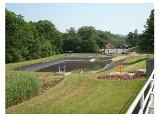
Lagoons Receiving Sludge from Sedentary Basin and Backwash Wastewater

This project consists of the design of the upgrades and improvements to the Broad Brook Water Treatment Plant and Pump Station, including replacement of all major items of equipment, installation of dissolved air floatation in existing sedimentation basins, installation of backwash recovery system, installation contact basin for manganese removal, and conversion from chlorine gas to sodium hypochlorite. This $2,008,997 project closed on an interim funding obligation to provide the amount of $1,597,153 at an interest rate of 2% for the design phase on April 25, 2012. The construction phase of the project is being carried over and will be funded when design is complete.