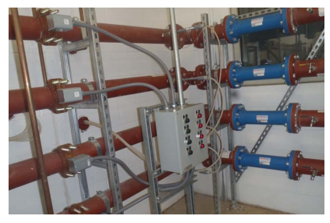
Town of Putnam – Interior of Water Treatment Facility

The Town of Putnam entered into a loan agreement in fiscal year 2010 to expand the existing Park Street well field with the drilling of several new drinking water wells and the construction of a new water treatment facility at the same location.