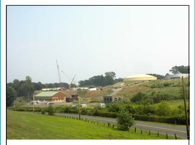
New Britain Water Facility, New Britain, CT

The EPA 1999 Drinking Water Infrastructure Needs Survey findings were published in February 2001 and evidenced a $340 million decrease in the need for DWSRF financial assistance to $670 million. Connecticut will be participating in the 2003 Drinking Water Infrastructure Needs Survey.