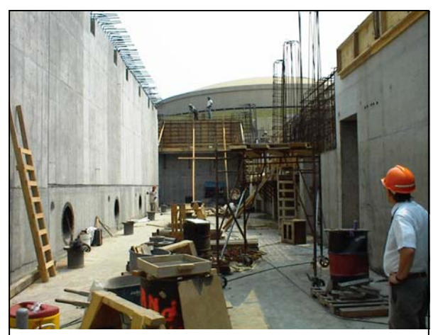
New Britain Plant Construction Site New Britain, CT

Moody's Investors' Services and AAA from Standard & Poors' Investors' Services. The CWF Subordinate bonds are rated AAA from Fitch IBCA, Aa1 from Moody's Investors' Services and AA+ from Standard & Poors' Investors' Services.