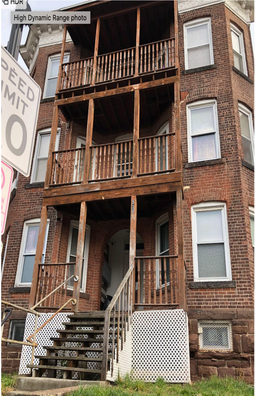
High Dynamic Range photo