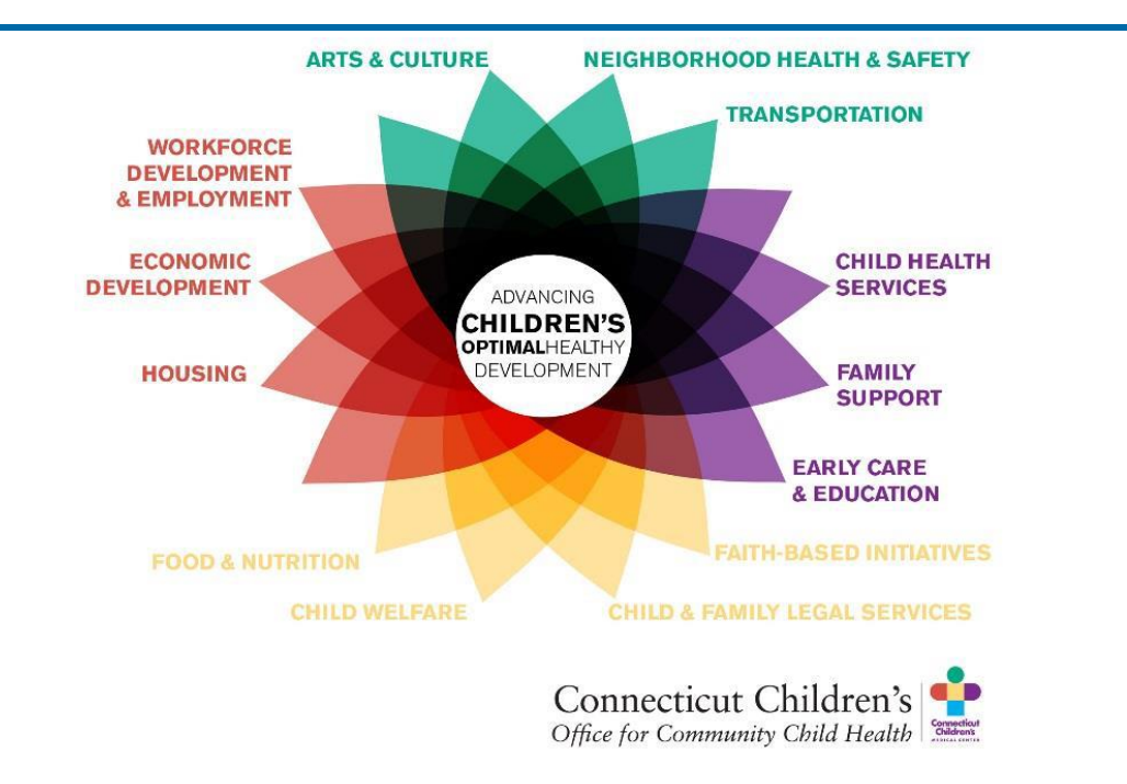
Figure 1: Flower Diagram