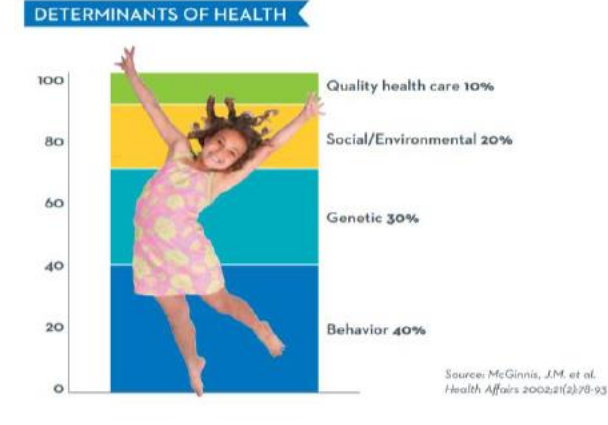
Figure 3: Determinants of Health

both the efficacy and cost effectiveness of such processes as health promotion, early detection, care coordination, and access to pediatric care reinforces the feasibility and benefits of such collaboration. For example, the Care Coordination Collaborative Model, an innovation developed by the Connecticut Children's Center for Care Coordination, brings together care coordinators from diverse sectors to enable synergy and collaboration; more effective problem solving for children and families; and fiscal efficiencies by minimizing duplicative efforts.