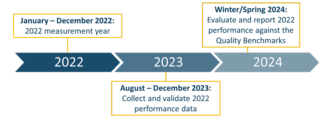
Figure 3: Data Collection, Evaluation and Reporting Cycle for Measurement Year 2022

OHS will evaluate and report AN and payer performance against the Quality Benchmarks in late winter / early spring two years following the measurement year to align with Cost Growth Benchmark reporting. Figure 3 below depicts the data collection, evaluation and reporting cycle for measurement year 2022.